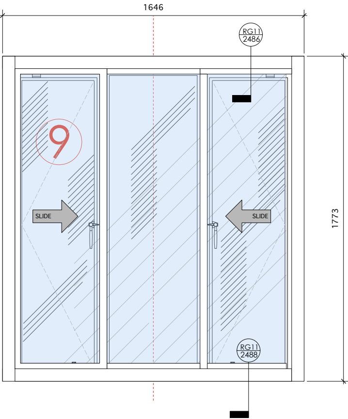
1 Type 9 window elevation (Lightwell 3 ) 1:10 @ A1