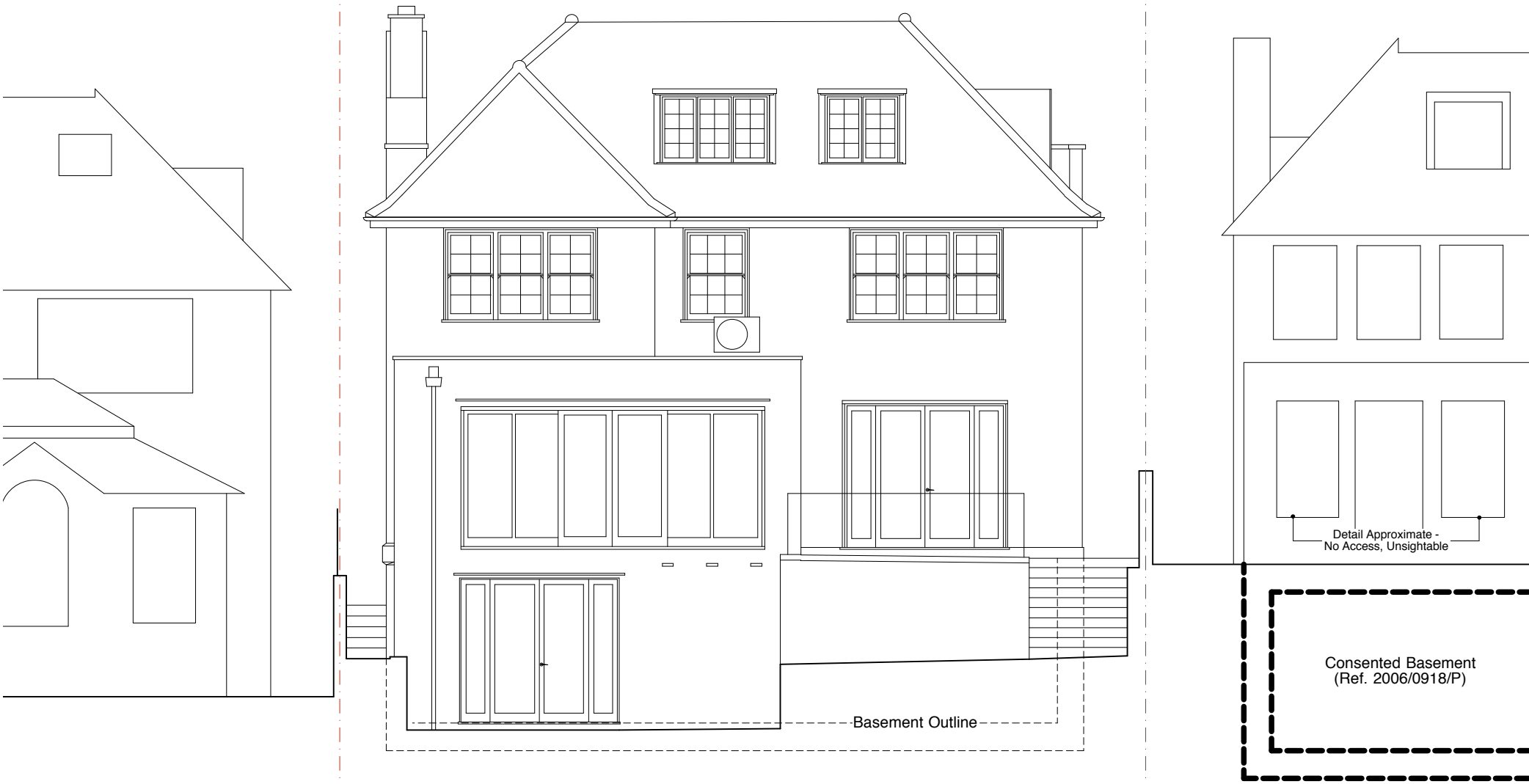
Rear / East Elevation