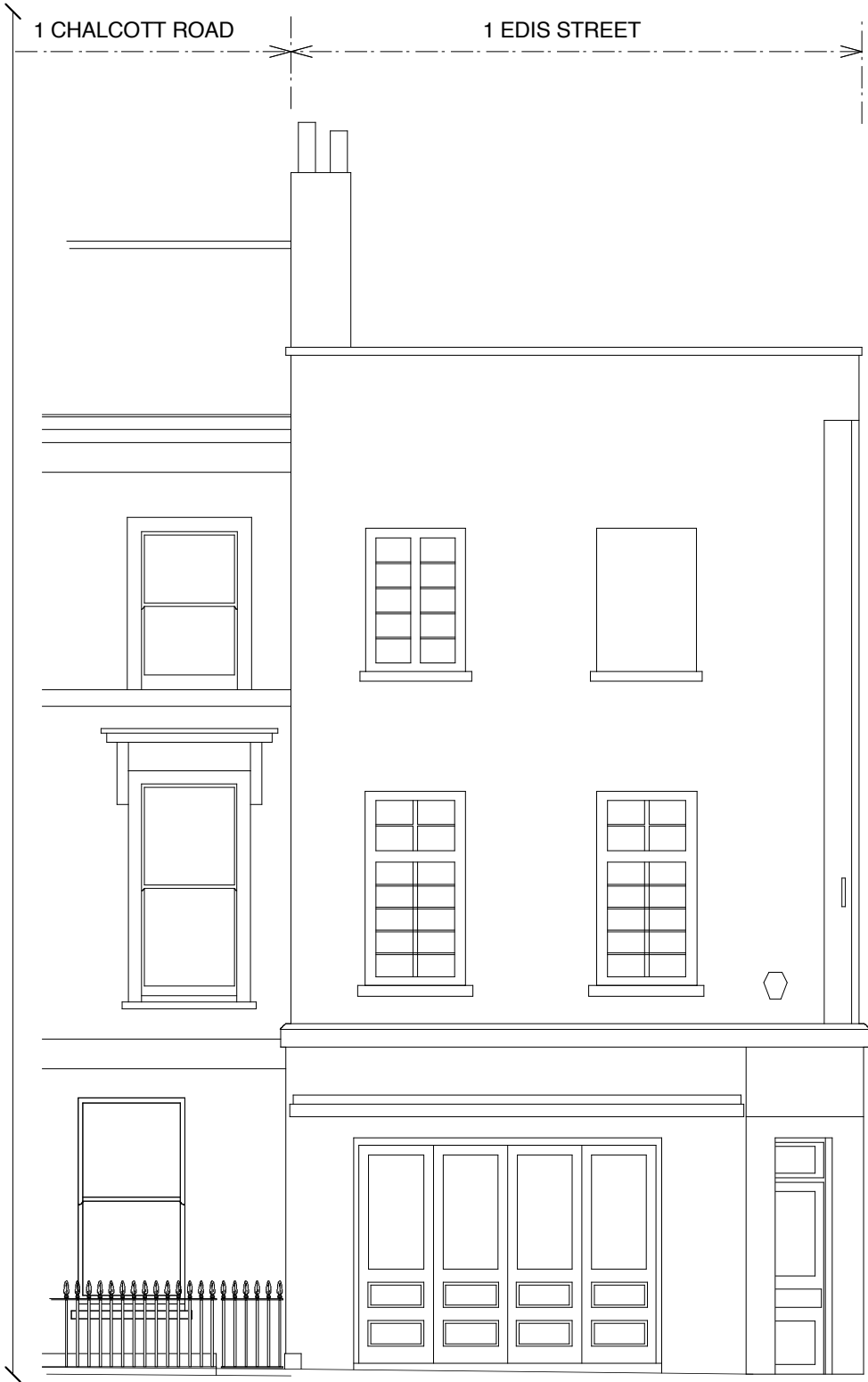
CR Existing Chalcott Road Elevation 1:75