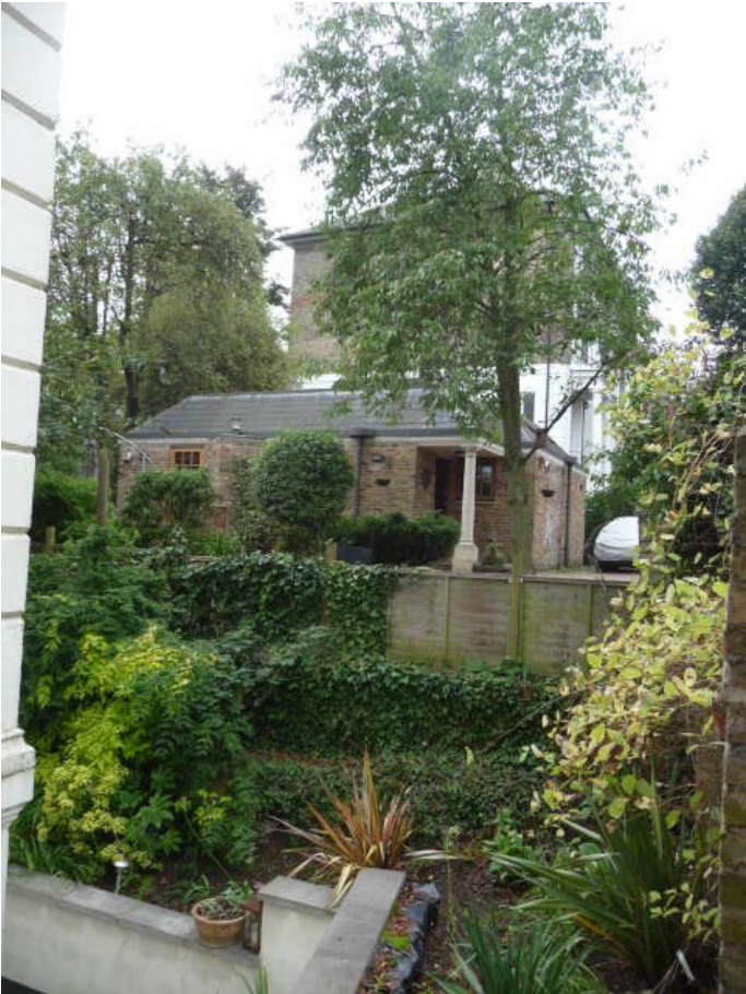
VIEW OF THE HOUSE FROM THE NEIGHBOURING PROPERTY