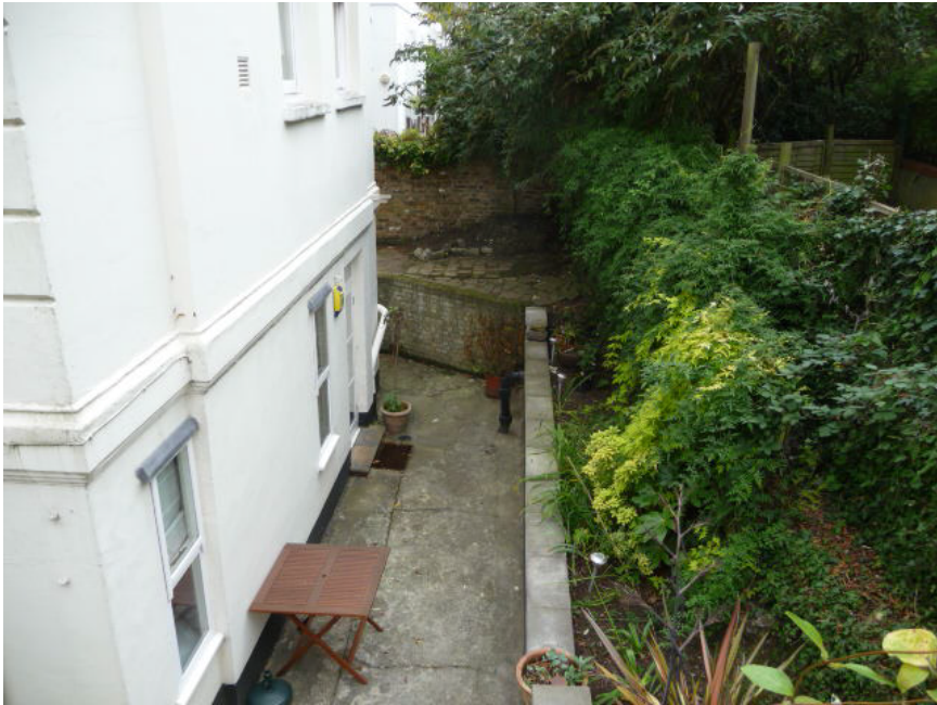
VIEW OF NEIGHBOURING HOUSE'S SUNKEN GARDEN