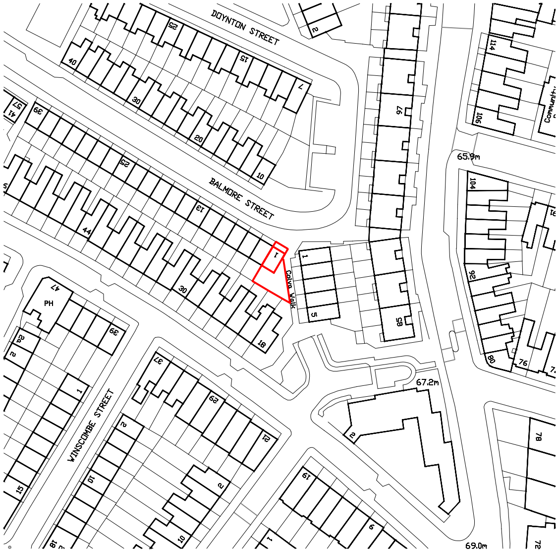
01 LOCATION PLAN SCALE 1:1250 ● A3

Do not scale from this drawing: work from noted dimensions only. All dimensions to be checked on site. These drawings are initial sketch layouts to establish spatial options only. They are subject to planning, building control and other statutory requirements.