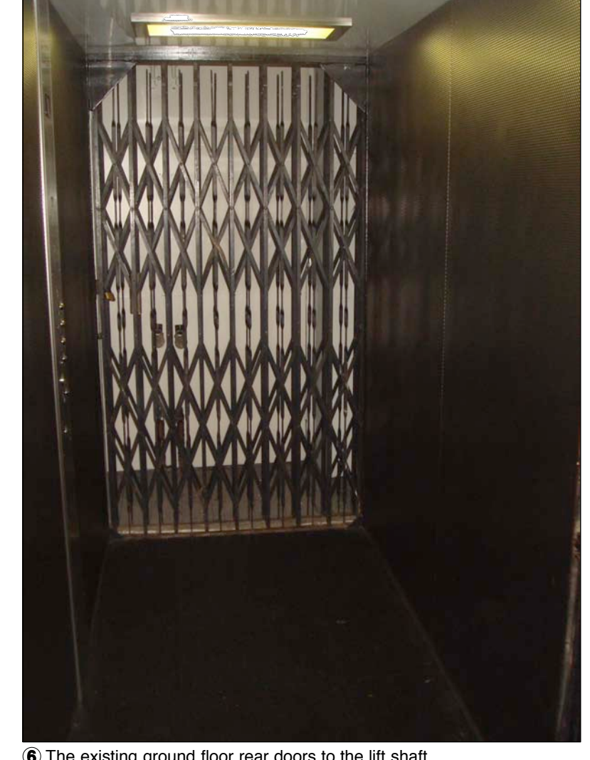
6 The existing ground floor rear doors to the lift shaft. (This opening is currently infilled from the exterior)