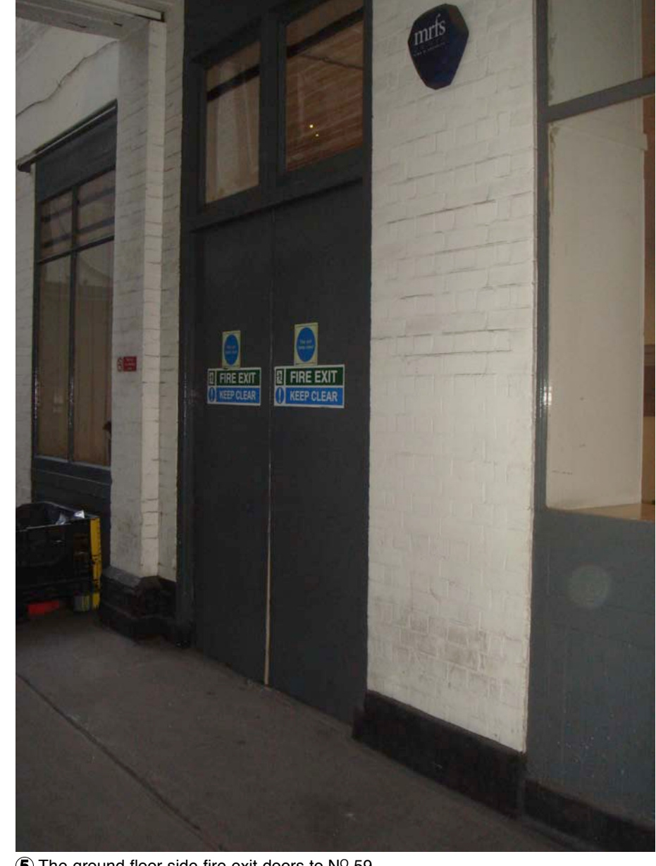
⑤ The ground floor side fire exit doors to No.59