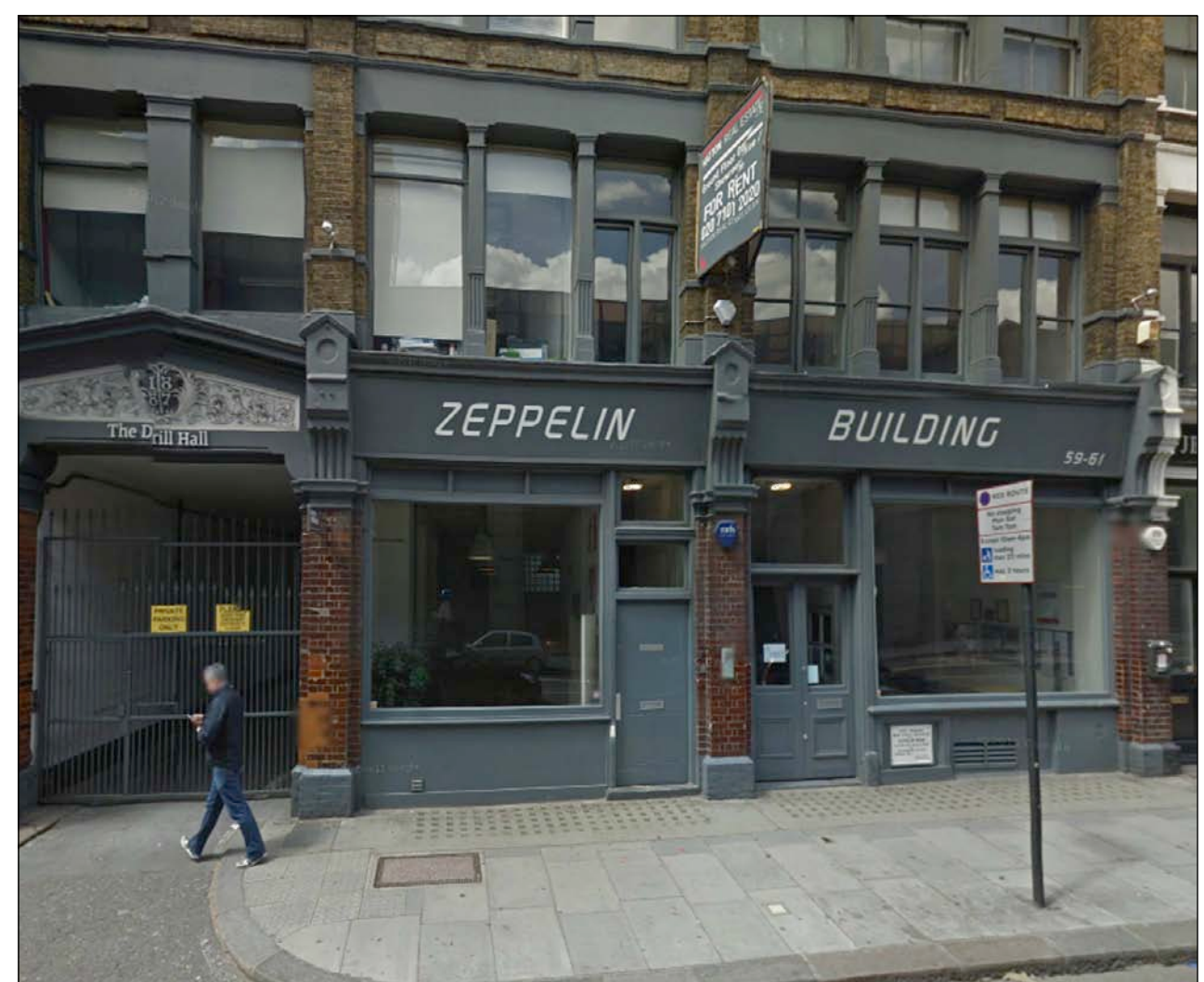
2 The existing shopfronts of the Zeppelin Building 59-61 Farringdon Road