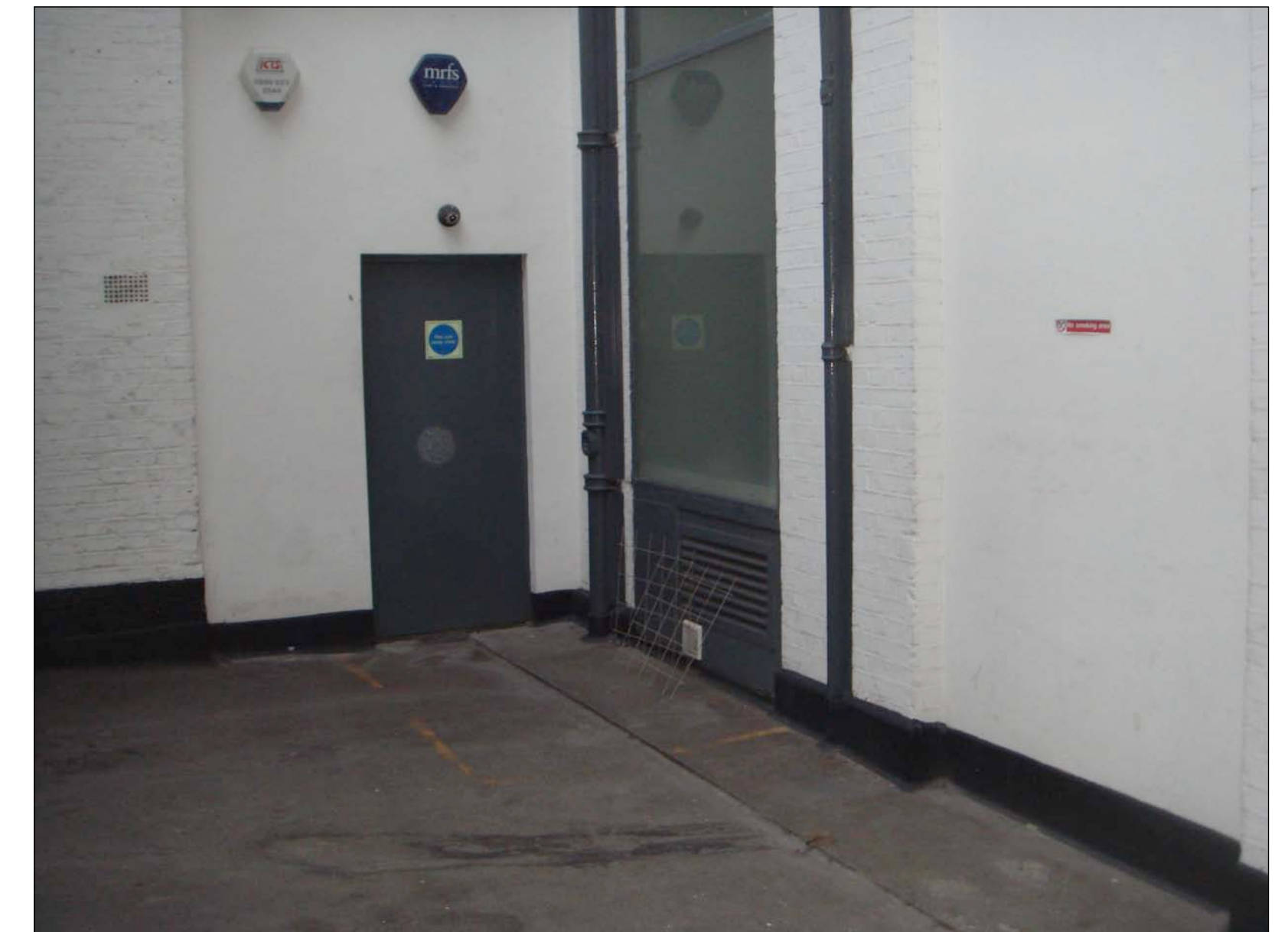
3 The rear ground floor window and infilled doorway to the lift shaft of No.59