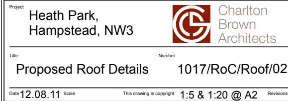
1:20 Detail of Roof makeup