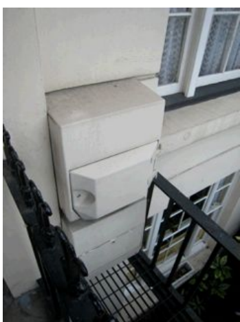
gas meter and refuse storage over front area light well

NOTE - 15 AMPTON STREET THERE ARE NO ORIGINAL FEATURES OF ANY KIND WHATSOEVER REMAINING IN THE PROPERTY. IT IS ASSUMED THAT THE TERRACE (15, 17 & 19) HAS BEEN ENTIRELY REBUILT, APART FROM THE FRONT ELEVATION AND PARTY WALLS.