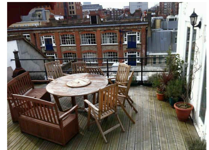
VIEW FROM TERRACE TO BUILDINGS AT REAR