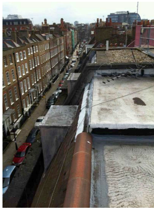
VIEW FROM APPLICATION SITE ROOF ALONG GREAT JAMES STREET