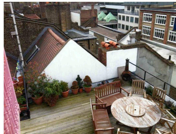
VIEW FROM FLAT ROOF DOWN TO TERRACE OF FLAT 10