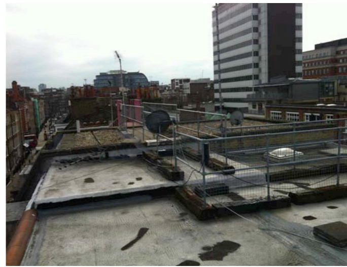
APPLICATION SITE ROOF WITH ESCAPE ROUTE FROM ADJACENT PROPERTIES