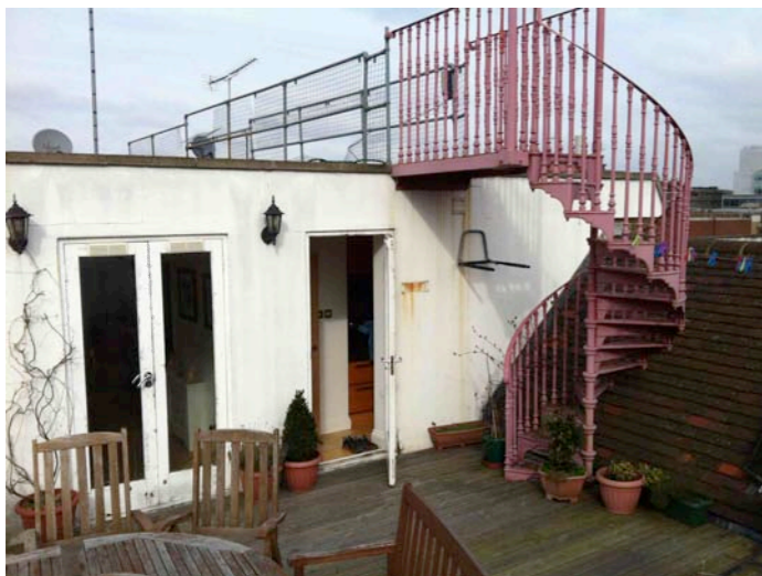
TERRACE OF FLAT 10 WITH DOORS TO LIVING ROOM AND KITCHEN, SPIRAL STAIRCASE IS PART OF ESCAPE ROUTE VIA FLAT ROOF