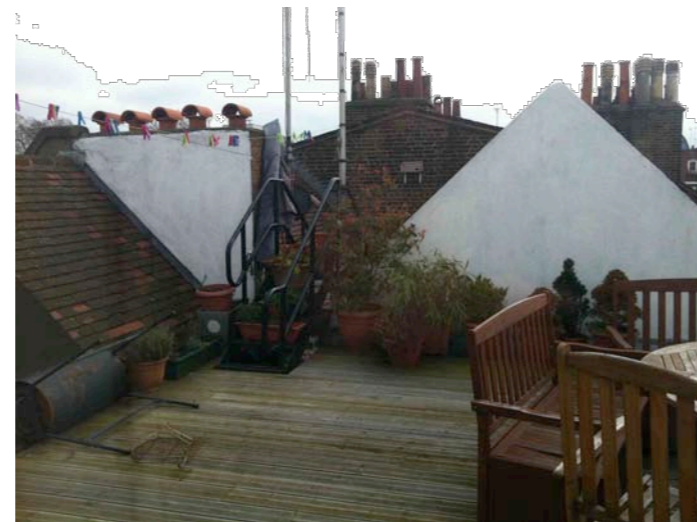
TERRACE OF FLAT 10, METAL STAIRS ARE PART OF ESCAPE ROUTE CONNECTING ADJACENT PROPERTIES