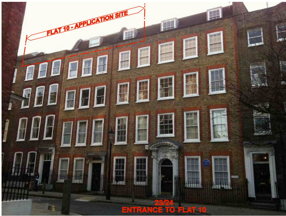
FRONT ELEVATION VIEWED FROM GREAT JAMES STREET