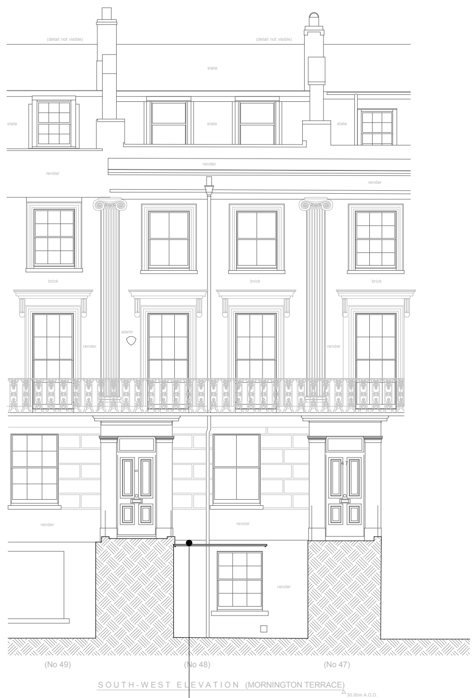
GLASS CANOPY OVER SUNKEN AREA

All existing windows on front and rear elevations to be refurbished and retained