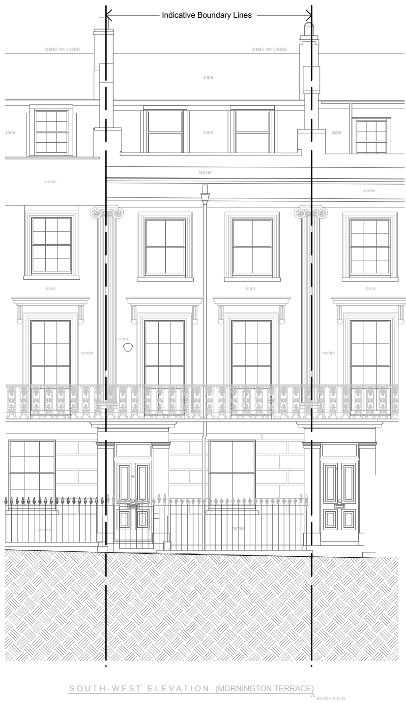
Proposed Street Front Elevation

All existing windows on front and rear elevations to be refurbished and retained