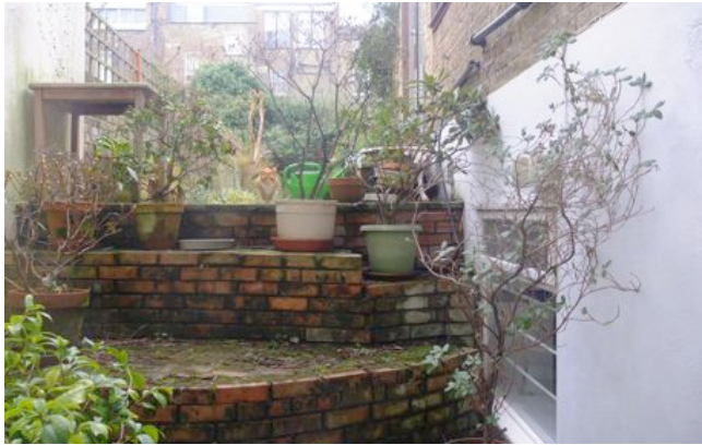
Existing steps to be removed: