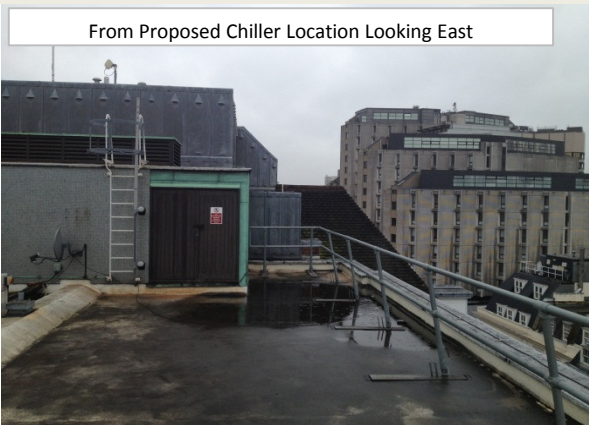
From Proposed Chiller Location Looking East