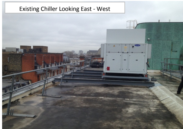
Existing Chiller Looking East - West