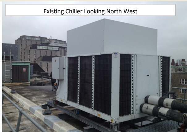
Existing Chiller Looking North West