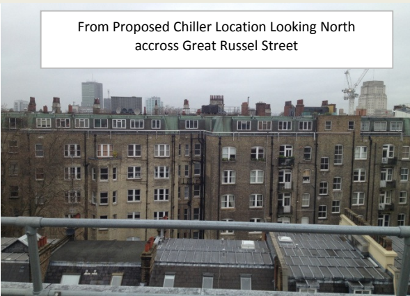
From Proposed Chiller Location Looking North across Great Russel Street