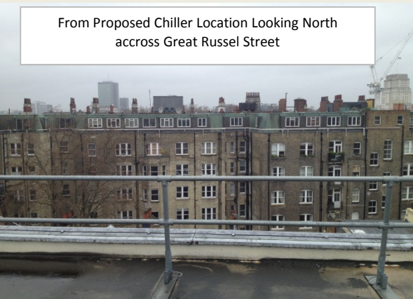
From Proposed Chiller Location Looking North across Great Russel Street