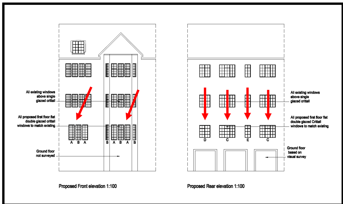
Extract of application drawings showing locations of windows and doors to be replaced