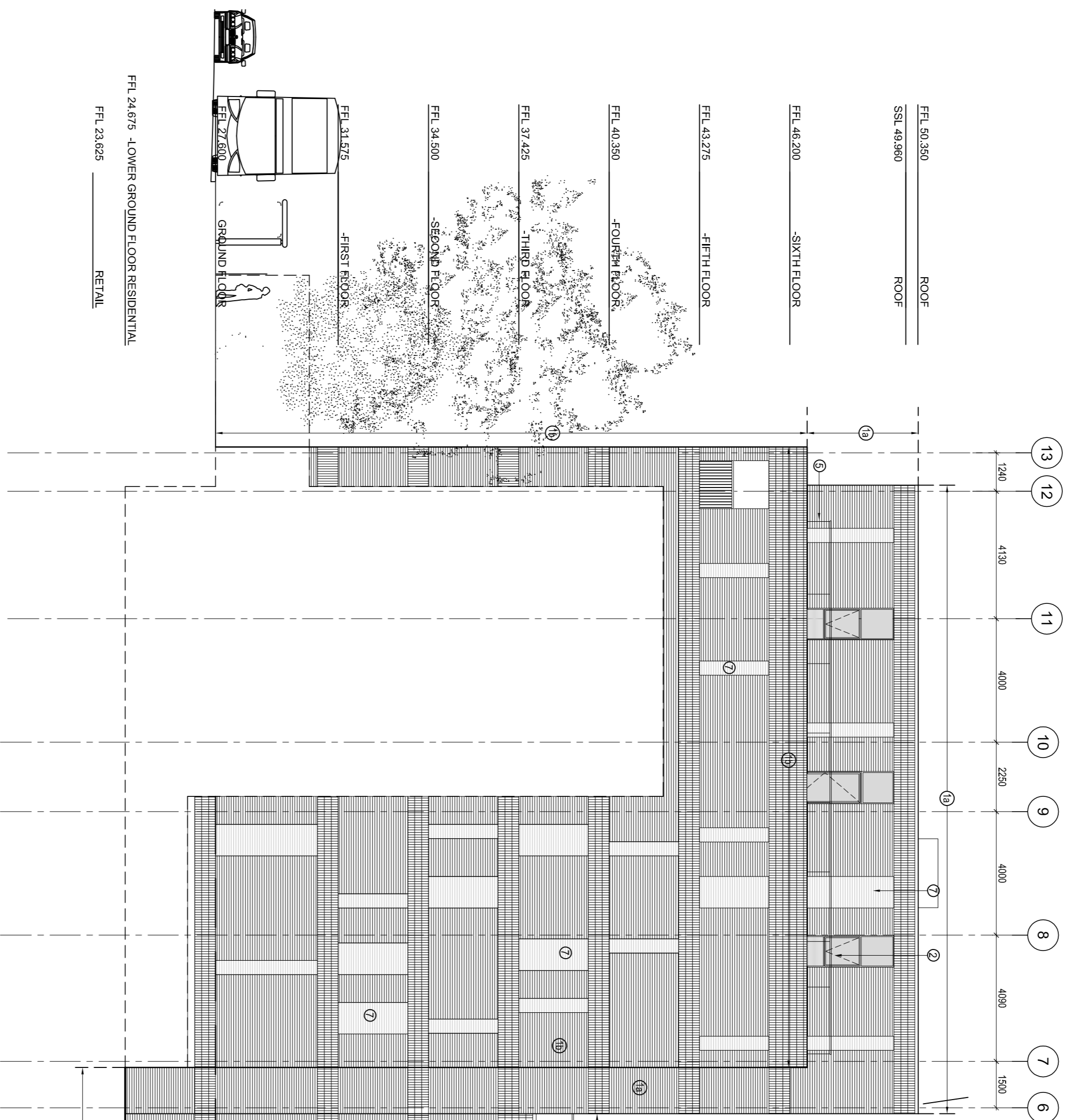
NORTH ELEVATION BLOCK C