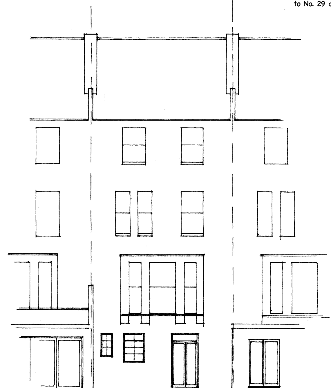
REAR ELEVATION EXISTING

Extension Finishes Flat roof; black finish material Walls; recovered London Stock facing bricks Joinery; painted wood frames to casement window and doors, style to reflect similar finishes on extension to No. 29 adjoining