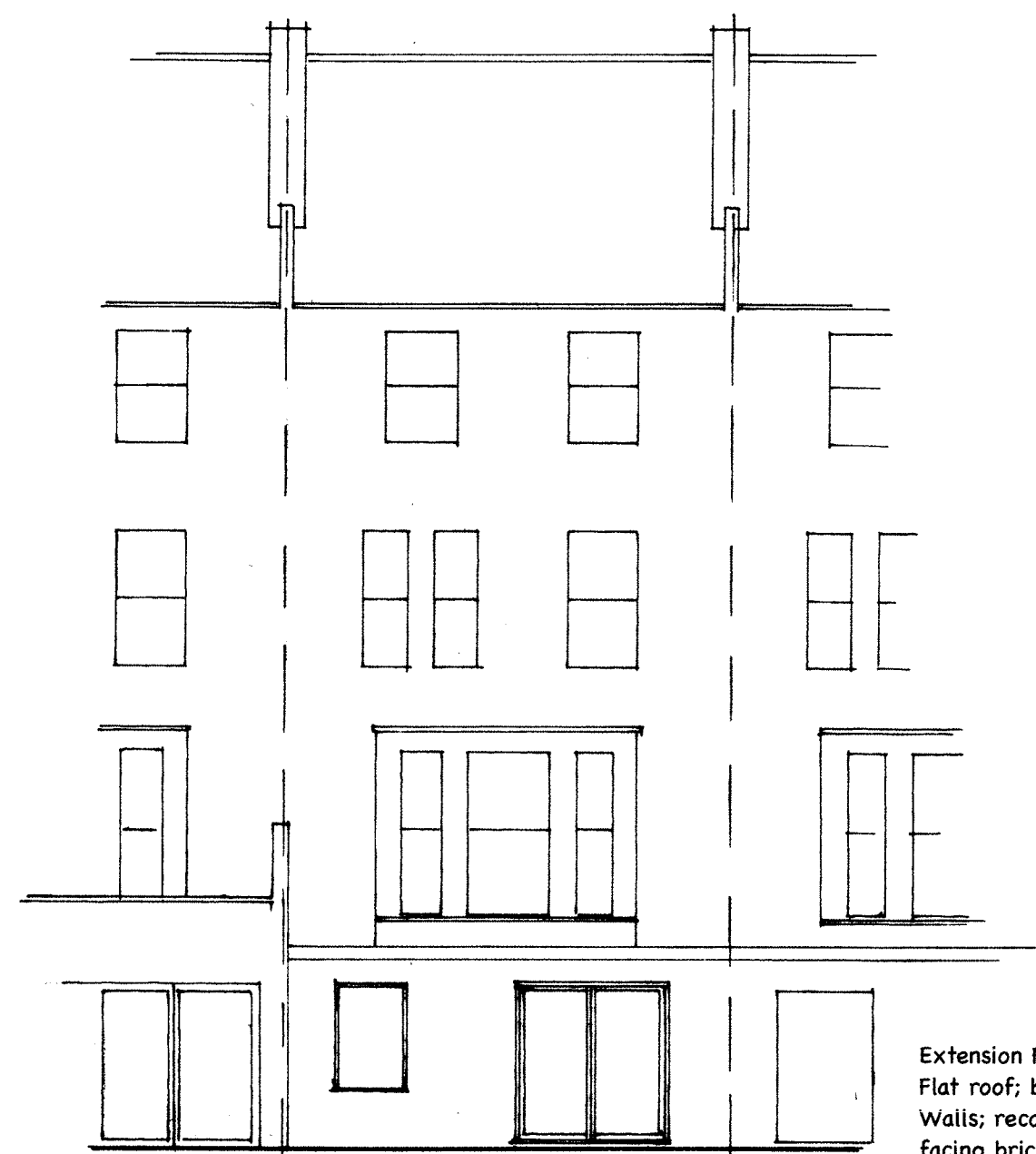
REAR ELEVATION PROPOSED