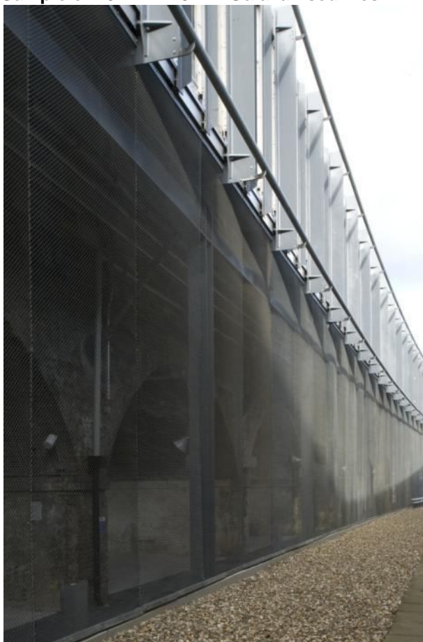
25mm x 25mm Galvanised Mesh used at Wood Lane Station