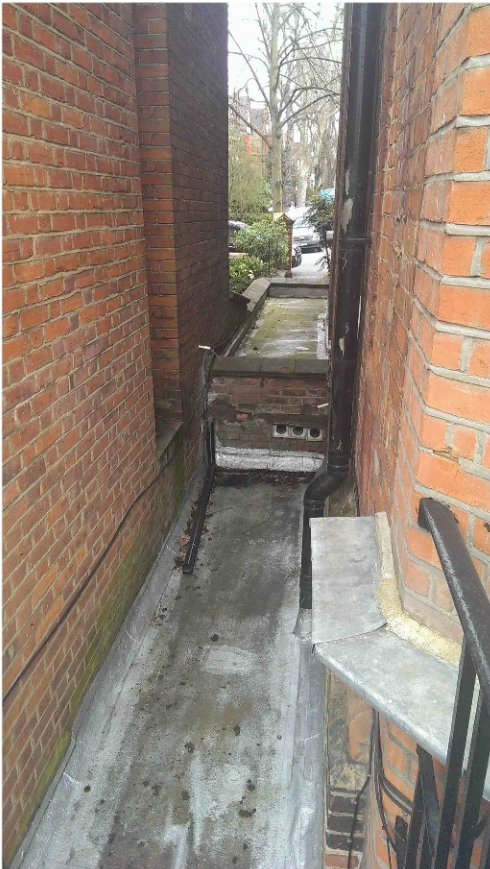
3 Garden Store Roof as viewed from balcony image 2