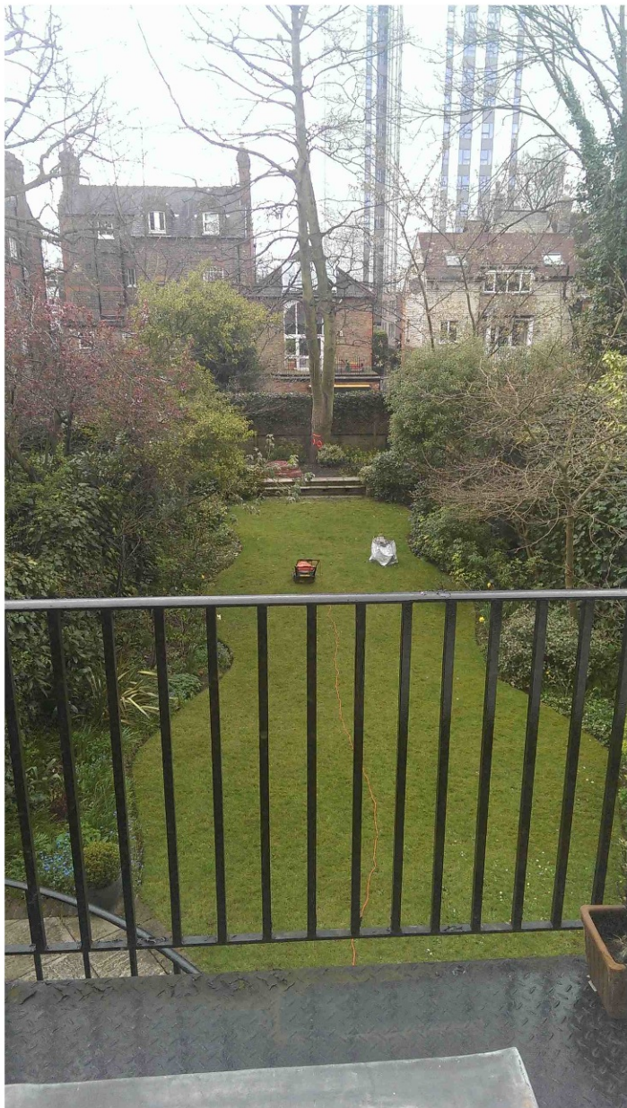
5 Garden as viewed from balcony