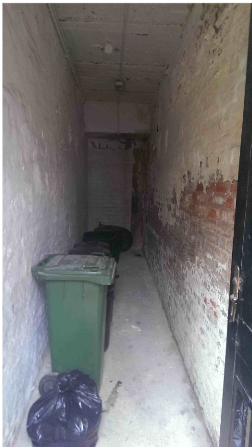
5 Communal Bin Store internal