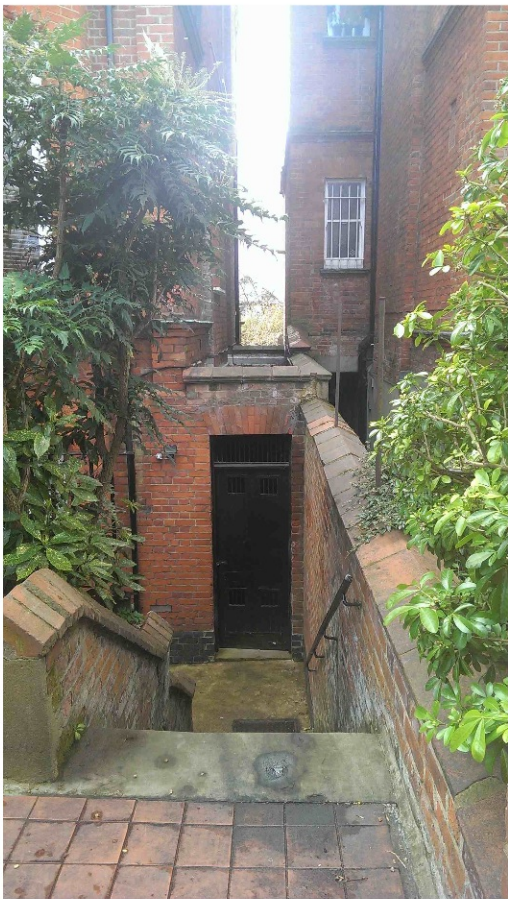
4 Communal Bin Store as viewed from street