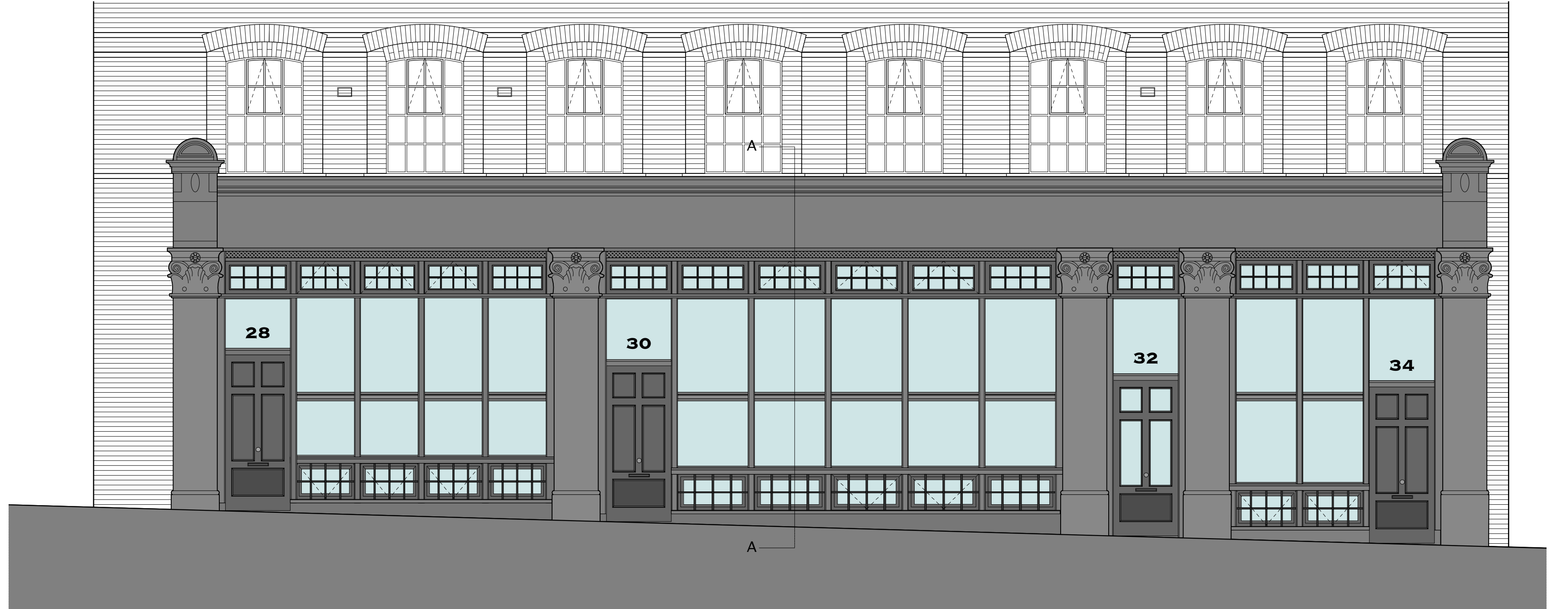
3 Elevation 1: 20