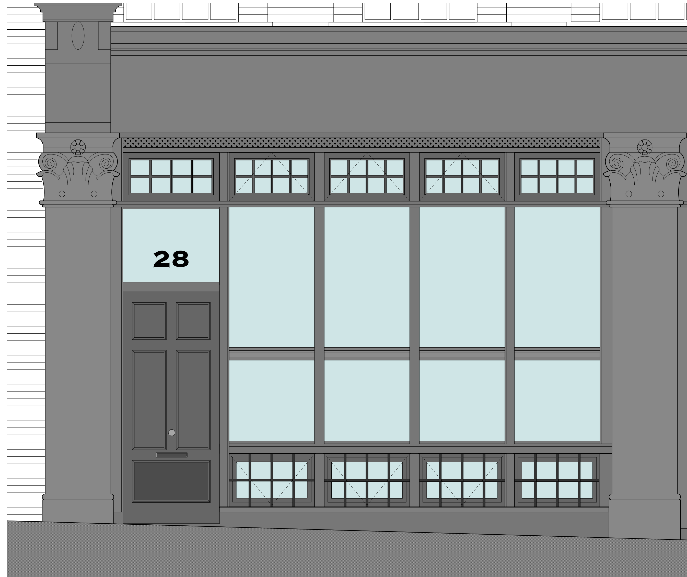
5 Detail Elevation 1: 20