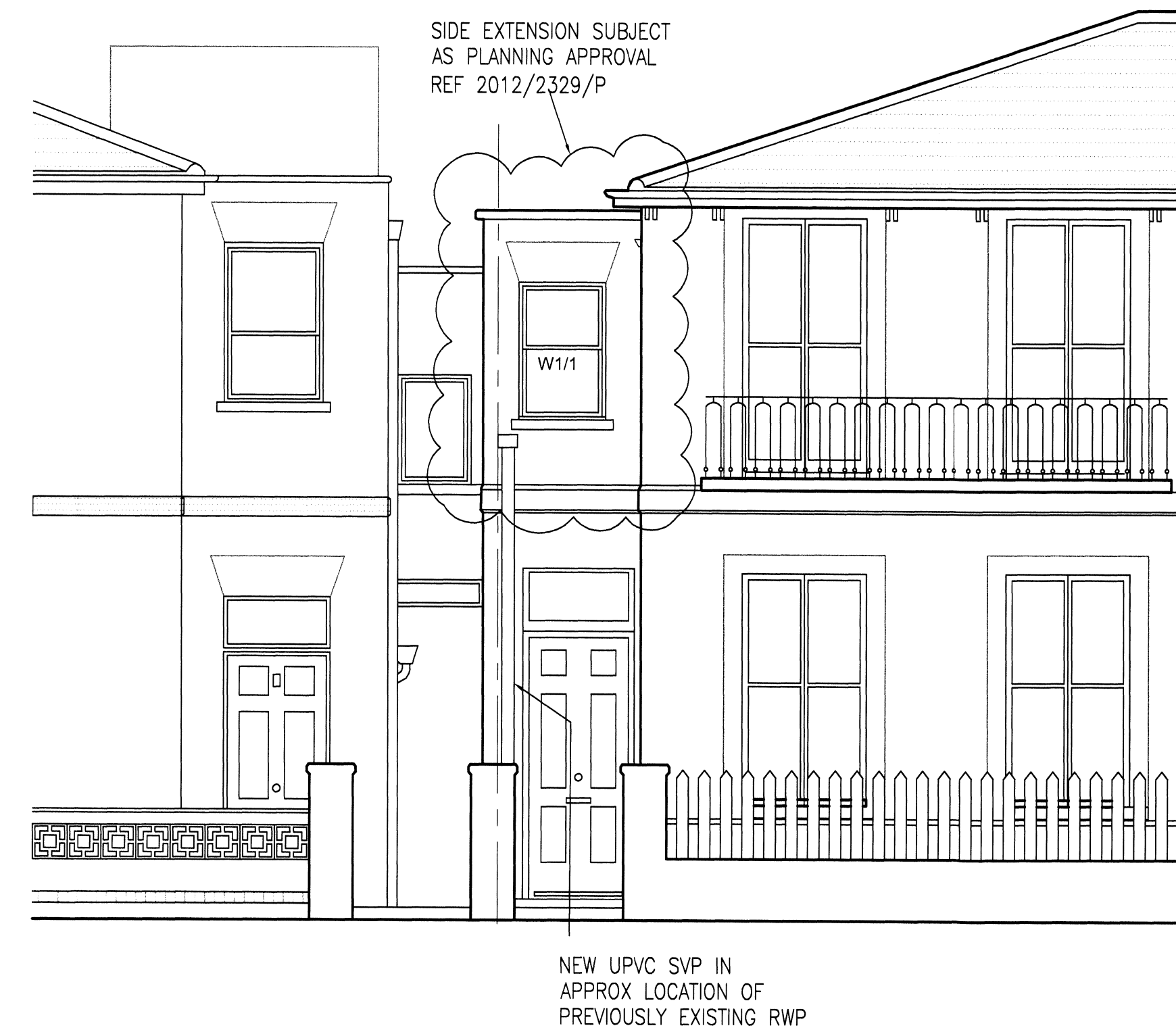
FRONT ELEVATION 1:50