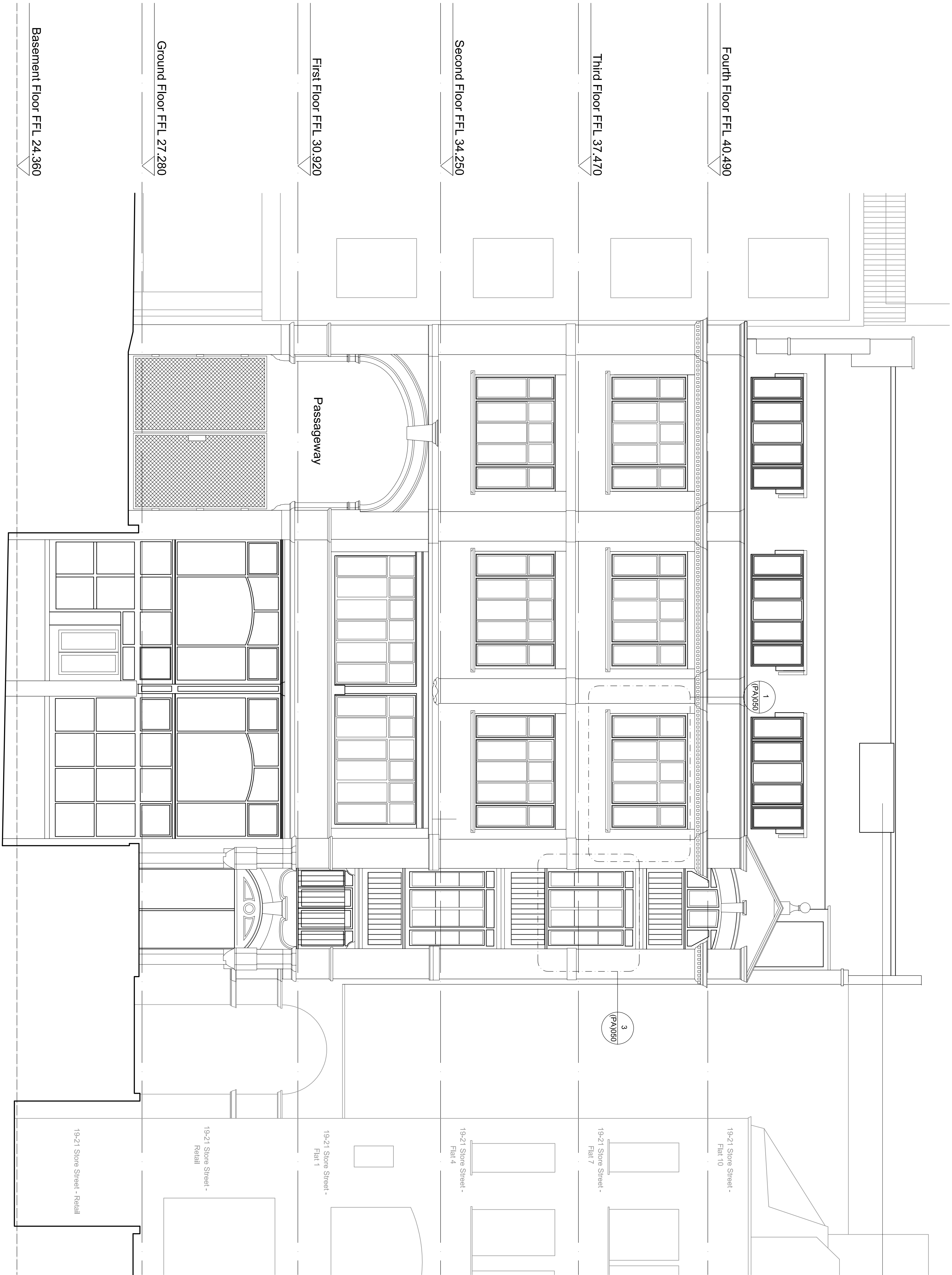
03 Elevation 03 : West Elevation (Alfred Place) Scale 1:50