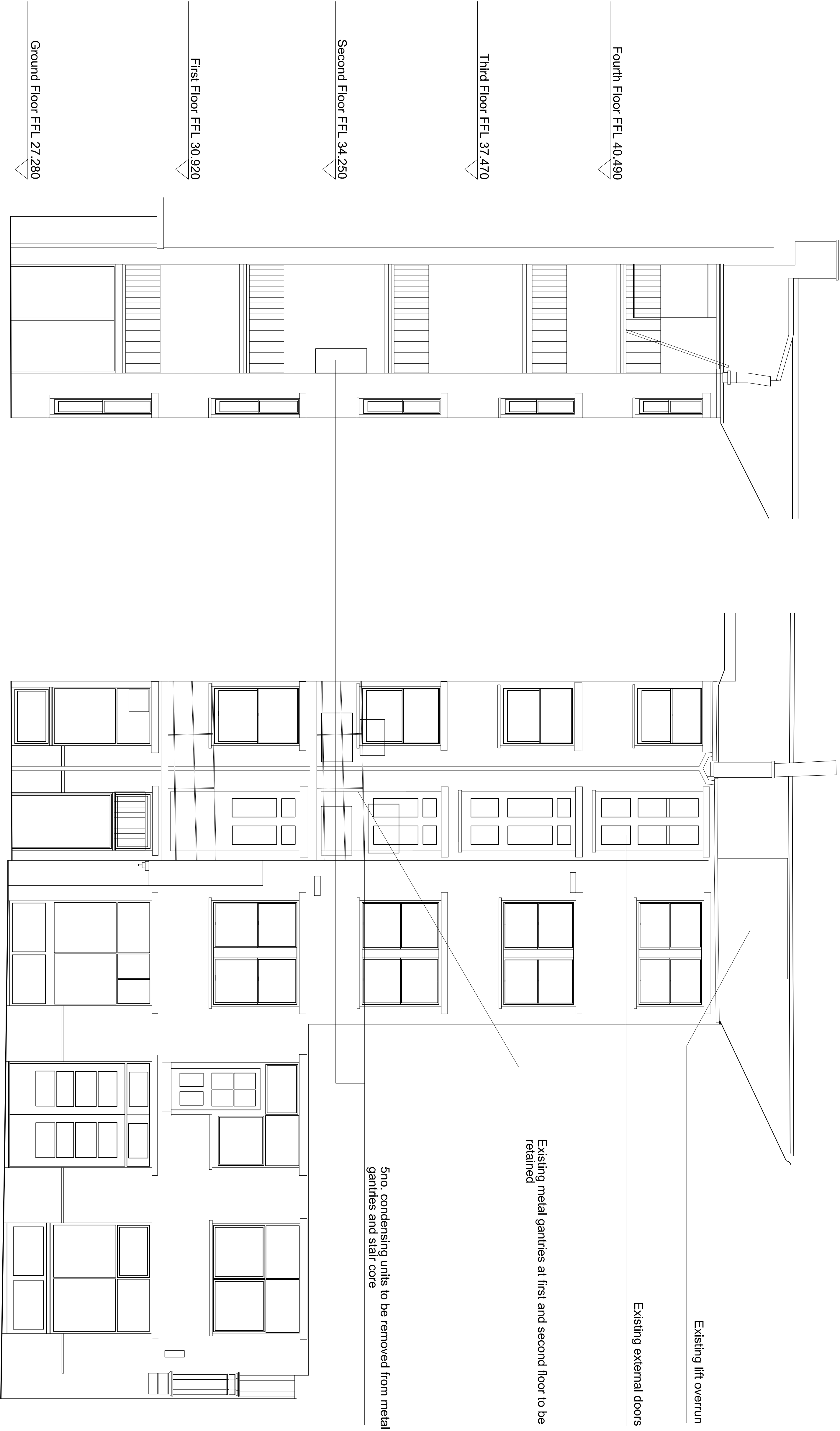
01 Elevation 01 : External Escape Stair Elevation Scale 1:50