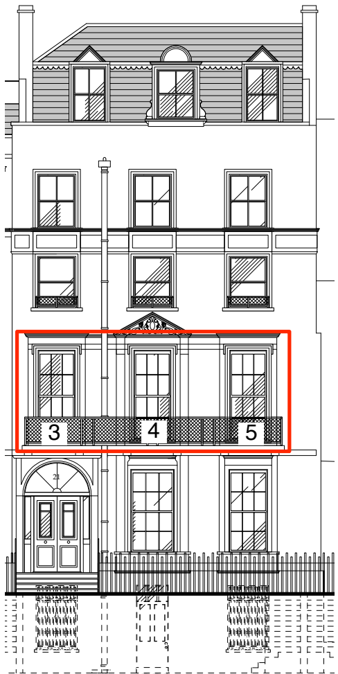
Existing Elevation (No change proposed)