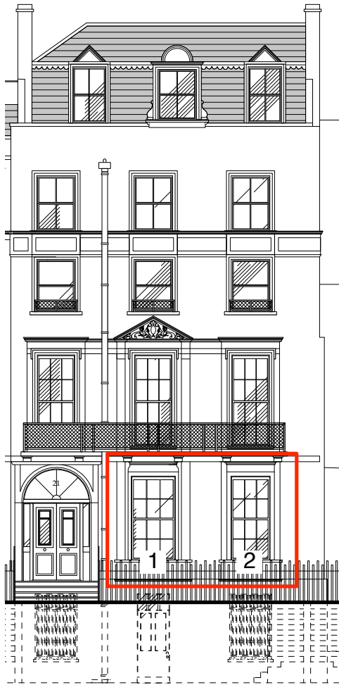
Existing Elevation (No change proposed)