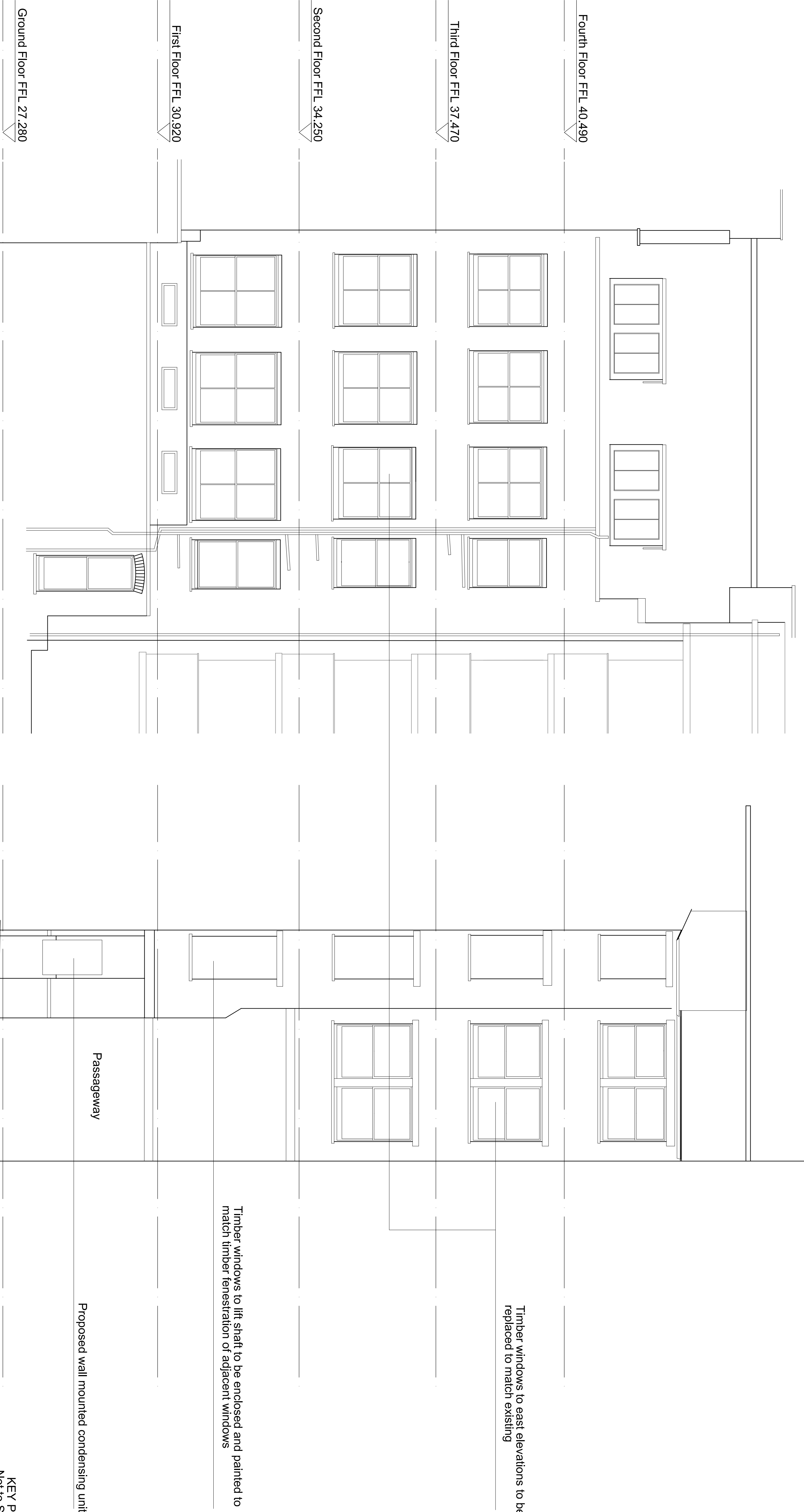
05 Elevation 05 : East Elevation Scale 1:50