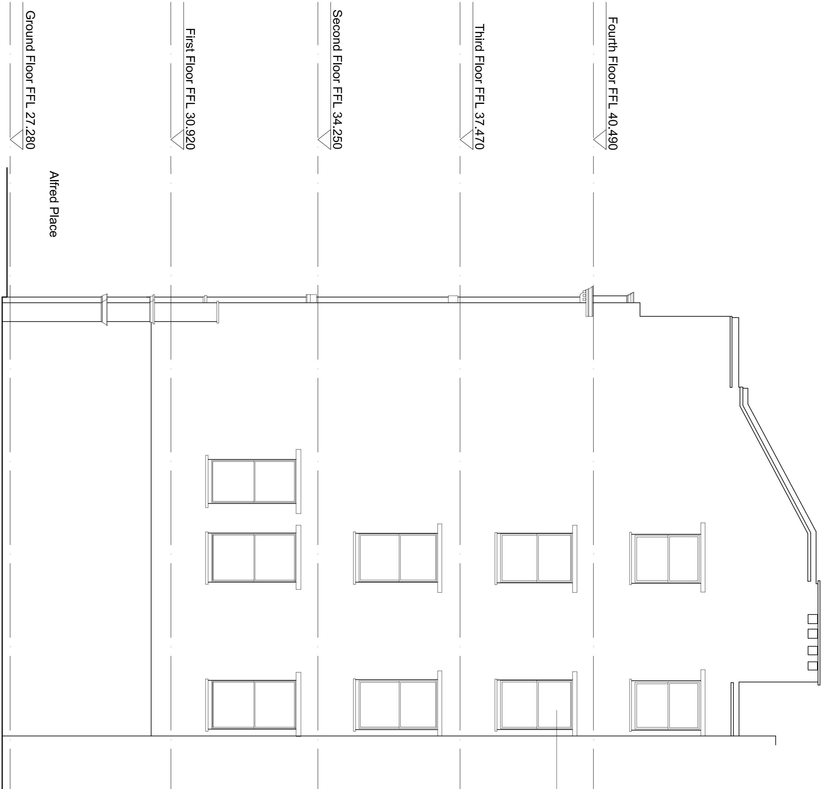
04 Elevation 04 : South Elevation Scale 1:50