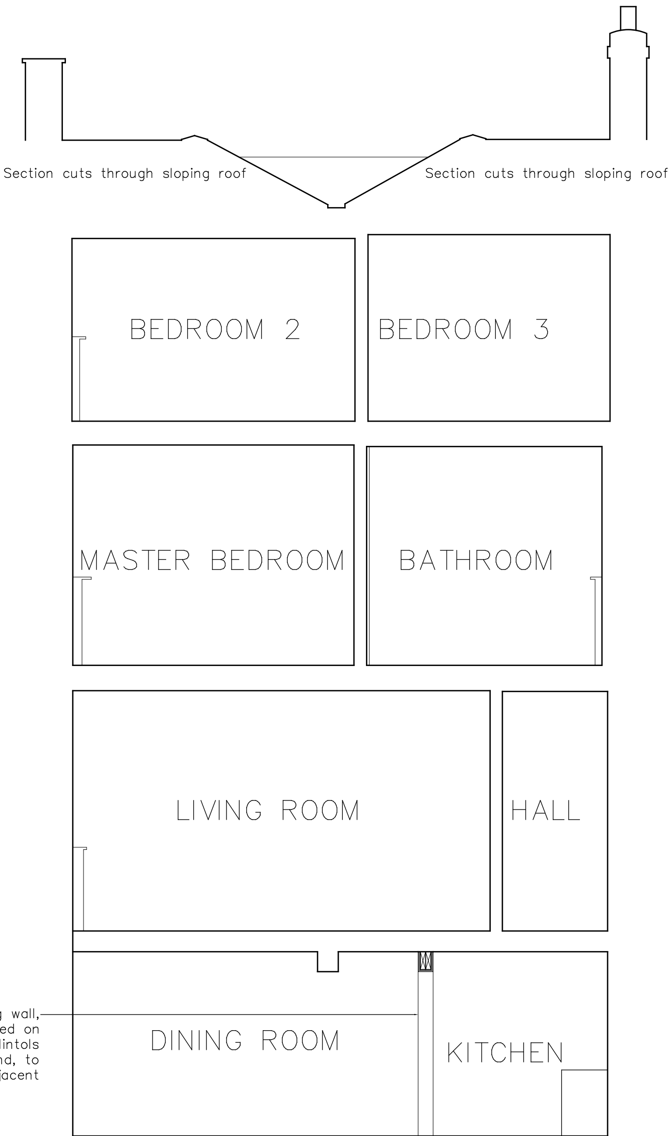
PROPOSED SECTION B-B SCALE 1:50 @ A1 & 1:100 @ A3