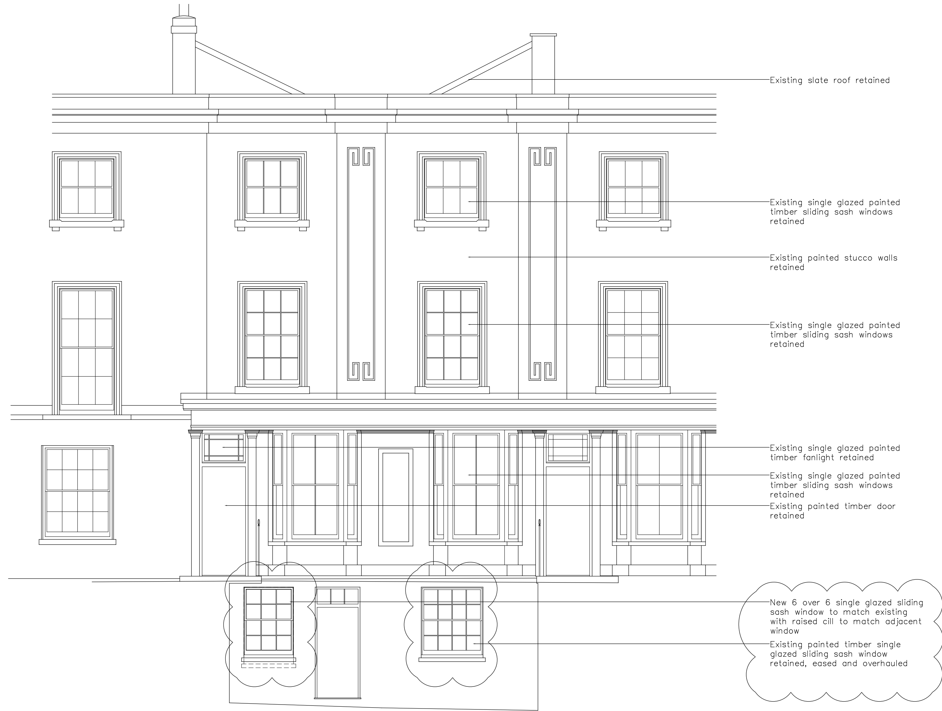
PROPOSED FRONT ELEVATION THROUGH LIGHTWELL SCALE 1:50 @ A1 & 1:100 @ A3