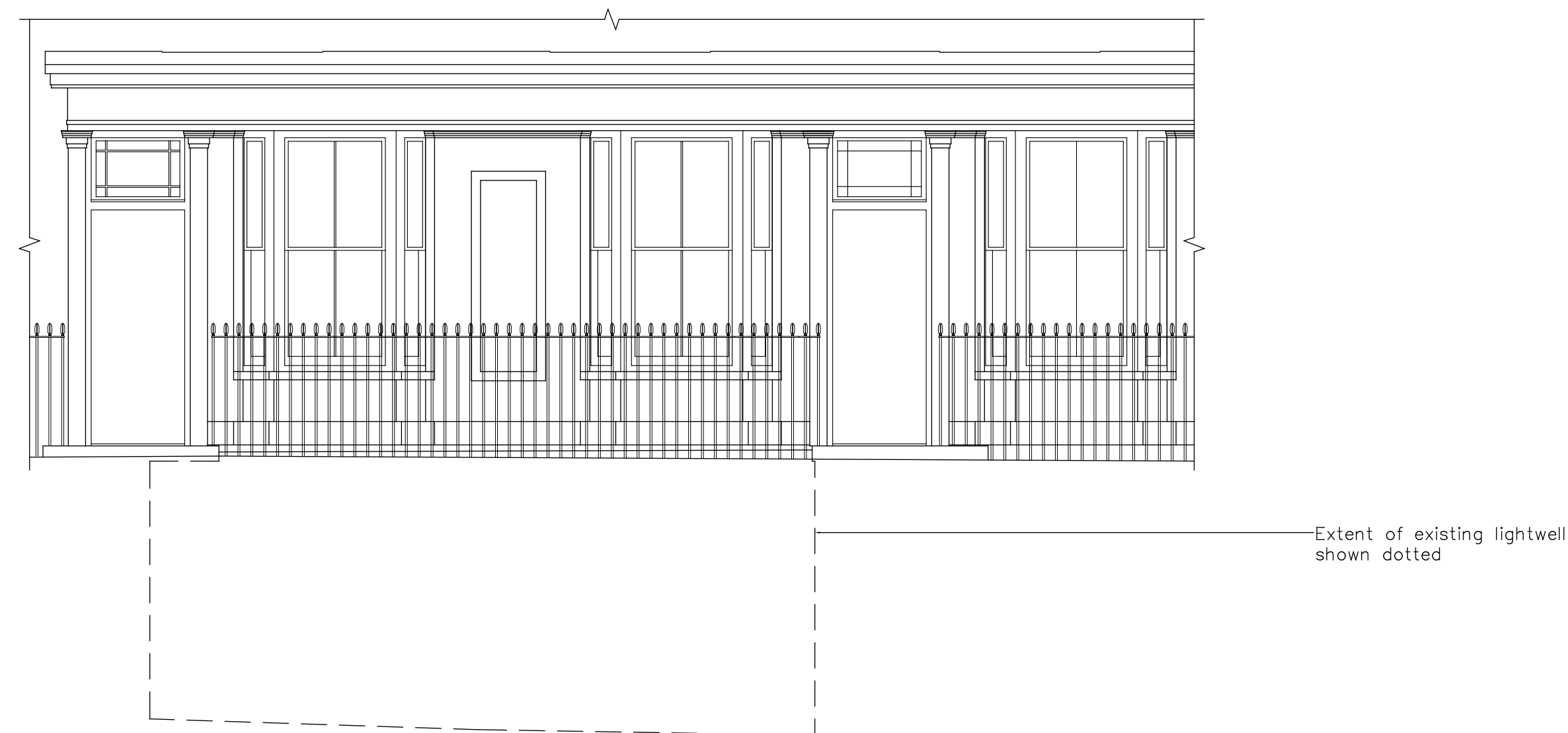
PROPOSED RAILING ELEVATION SCALE 1:50 @ A1 & 1:100 @ A3