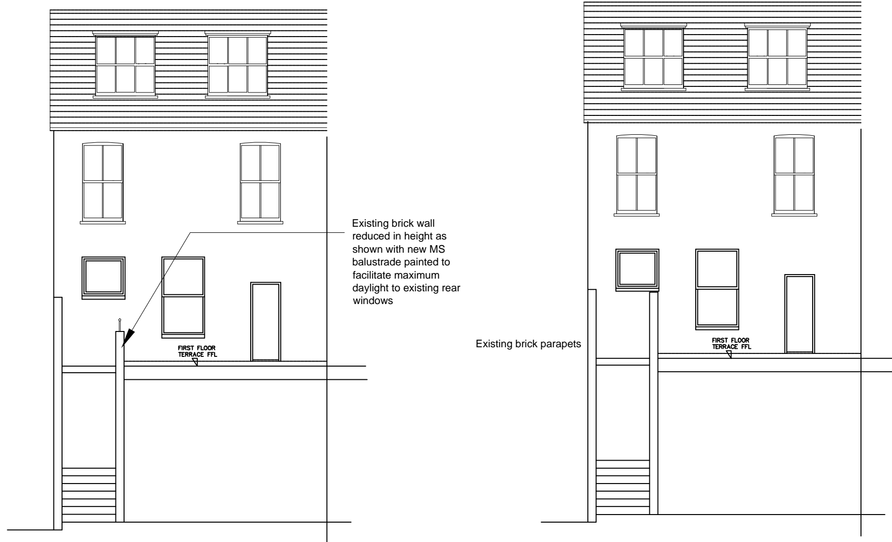
Section B-B as Proposed Scale 1:100