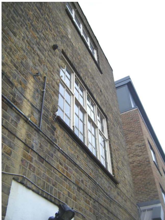
Appendix 2.8: Existing rear elevation of no interest