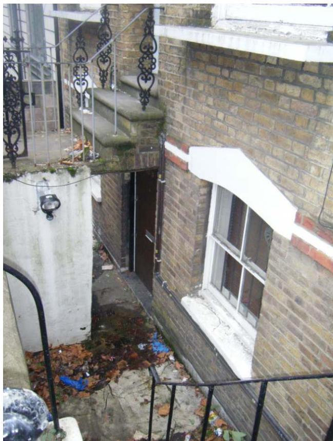
Appendix 2.4: Front light well