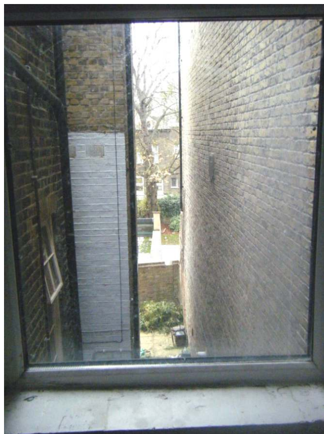
Appendix 2.9: View to the rear from exiting in fill extension