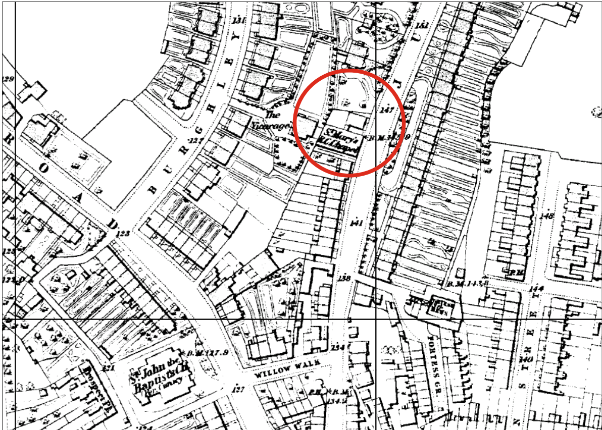
Appendix 1.1: 1873 Ordnance Survey Map