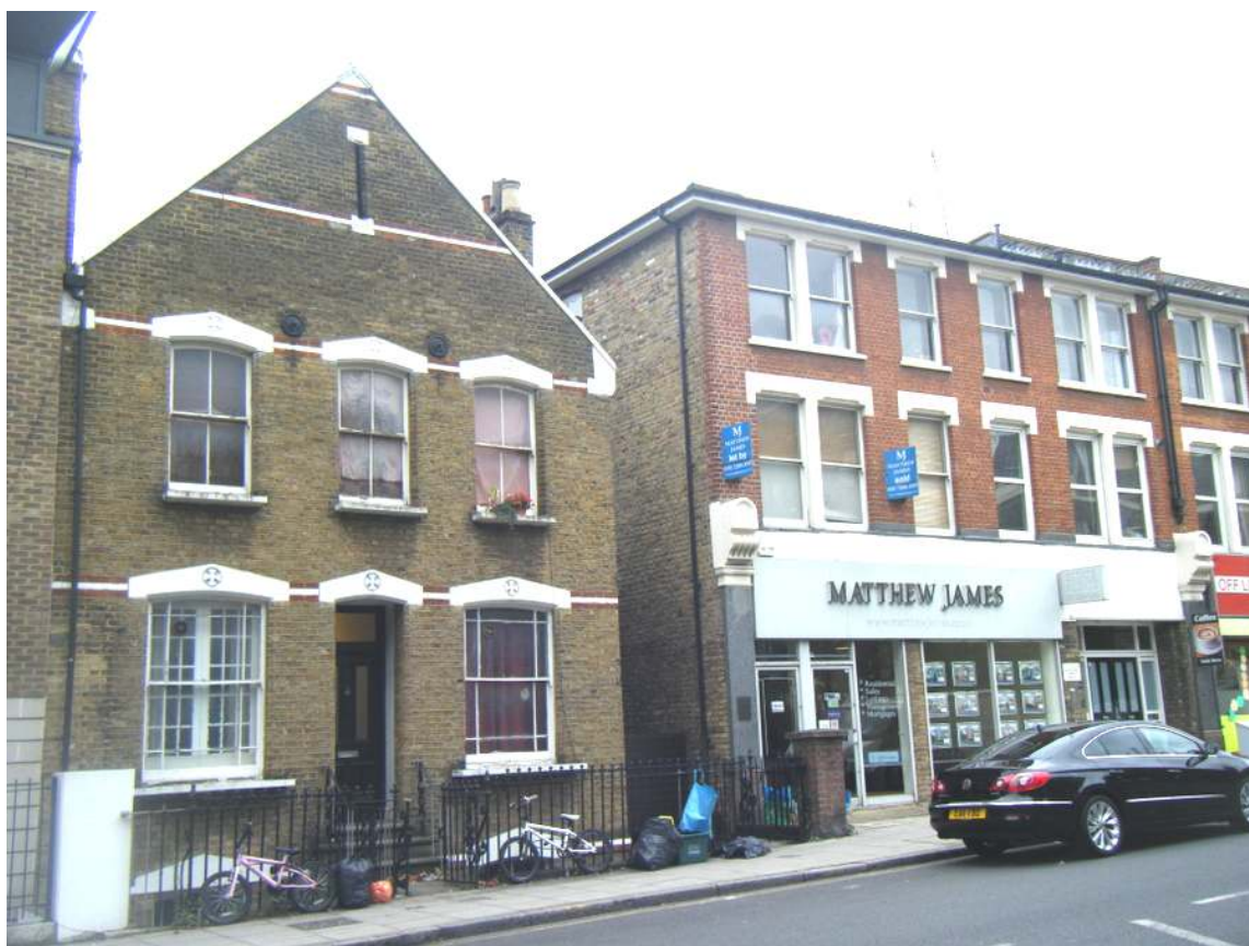
Appendix 2.3: No.41 and 43 Fortress Road