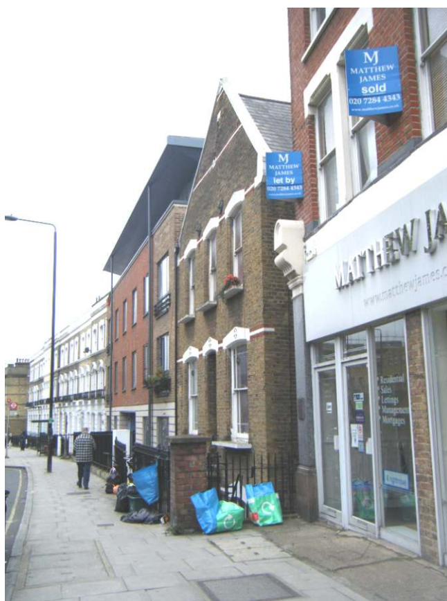
Appendix 2.2: Looking south down Fortress Road