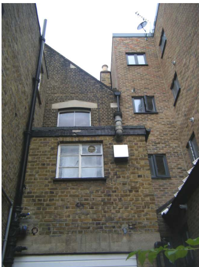
Appendix 2.6: Rear elevation (west side) with new development replacing church