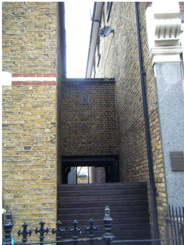
Appendix 2.5: Existing side in fill