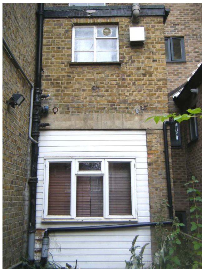
Appendix 2.7: Rear elevation with 1960s and later fenestration