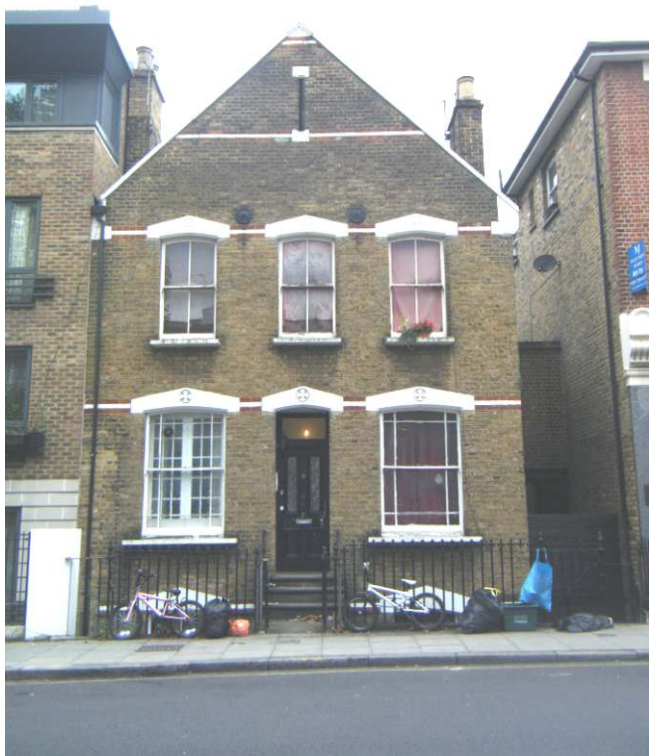
Appendix 2.1: Front Elevation