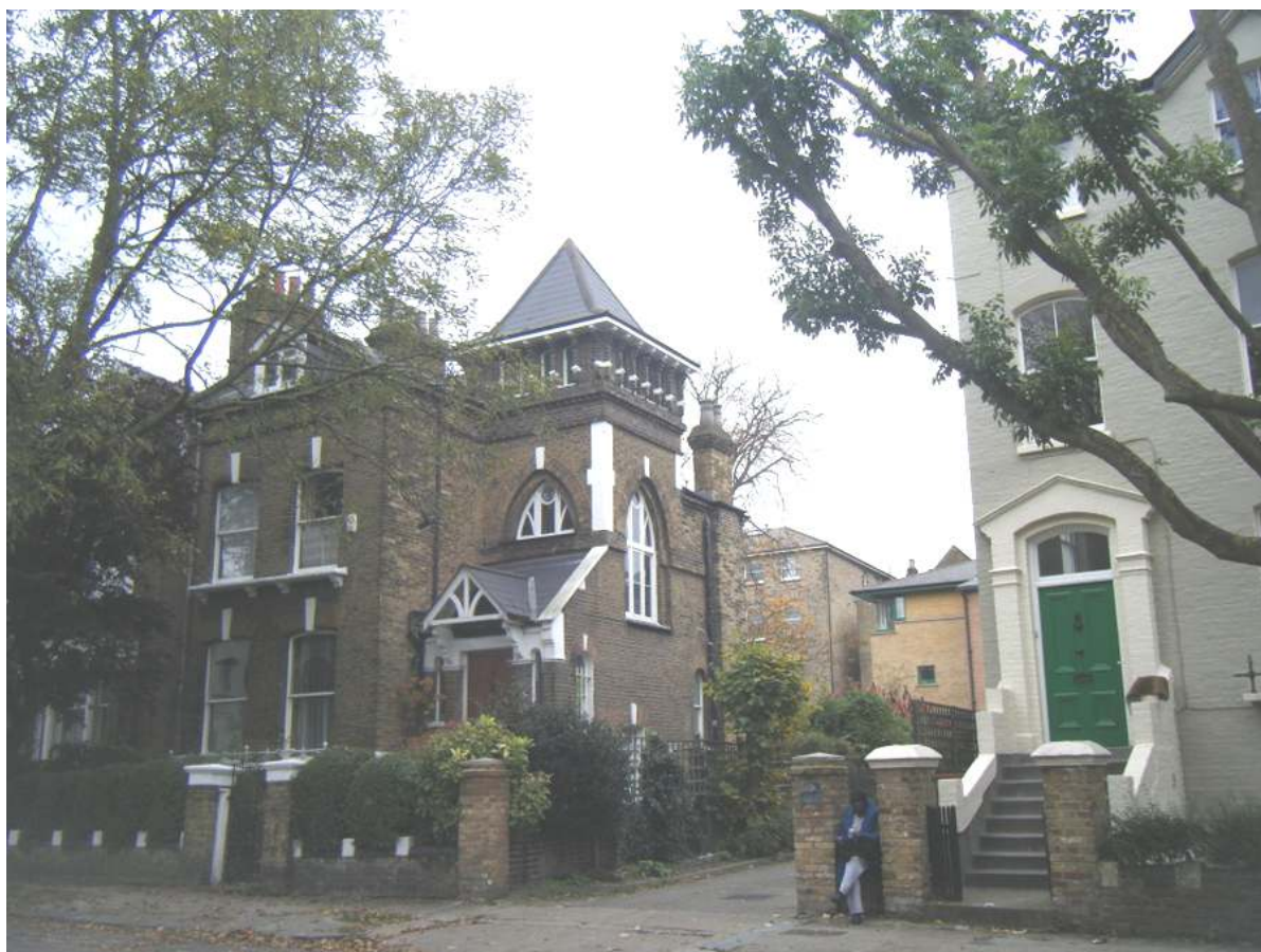
Appendix 2.10: View from Burghley Road looking towards the rear of buildings on Fortress Road