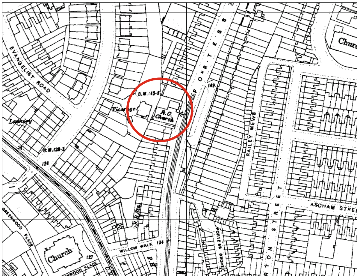
Appendix 1.2: 1916 Ordnance Survey Map