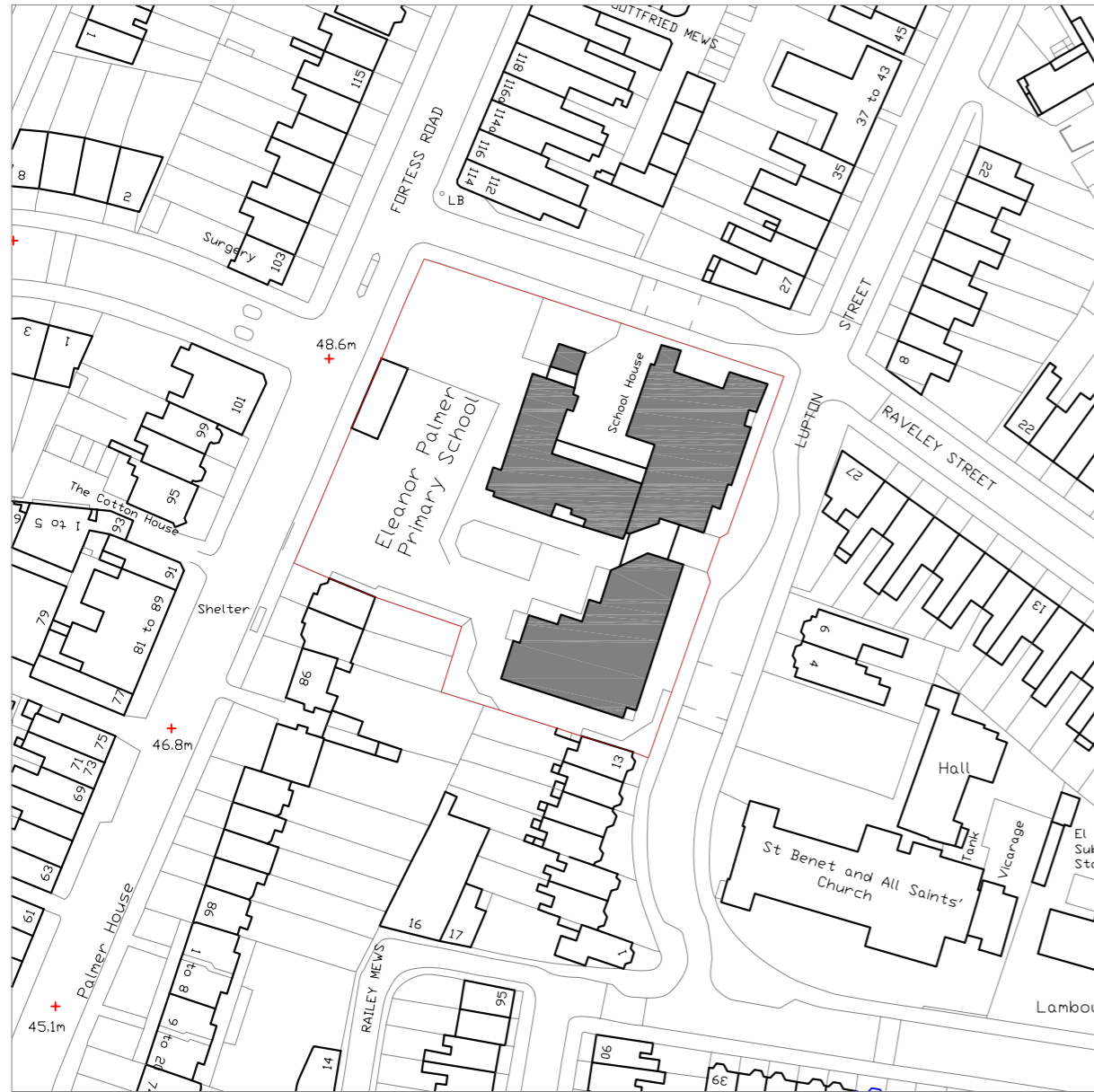
EXISTING SITE LOCATION PLAN SCALE 1:1250