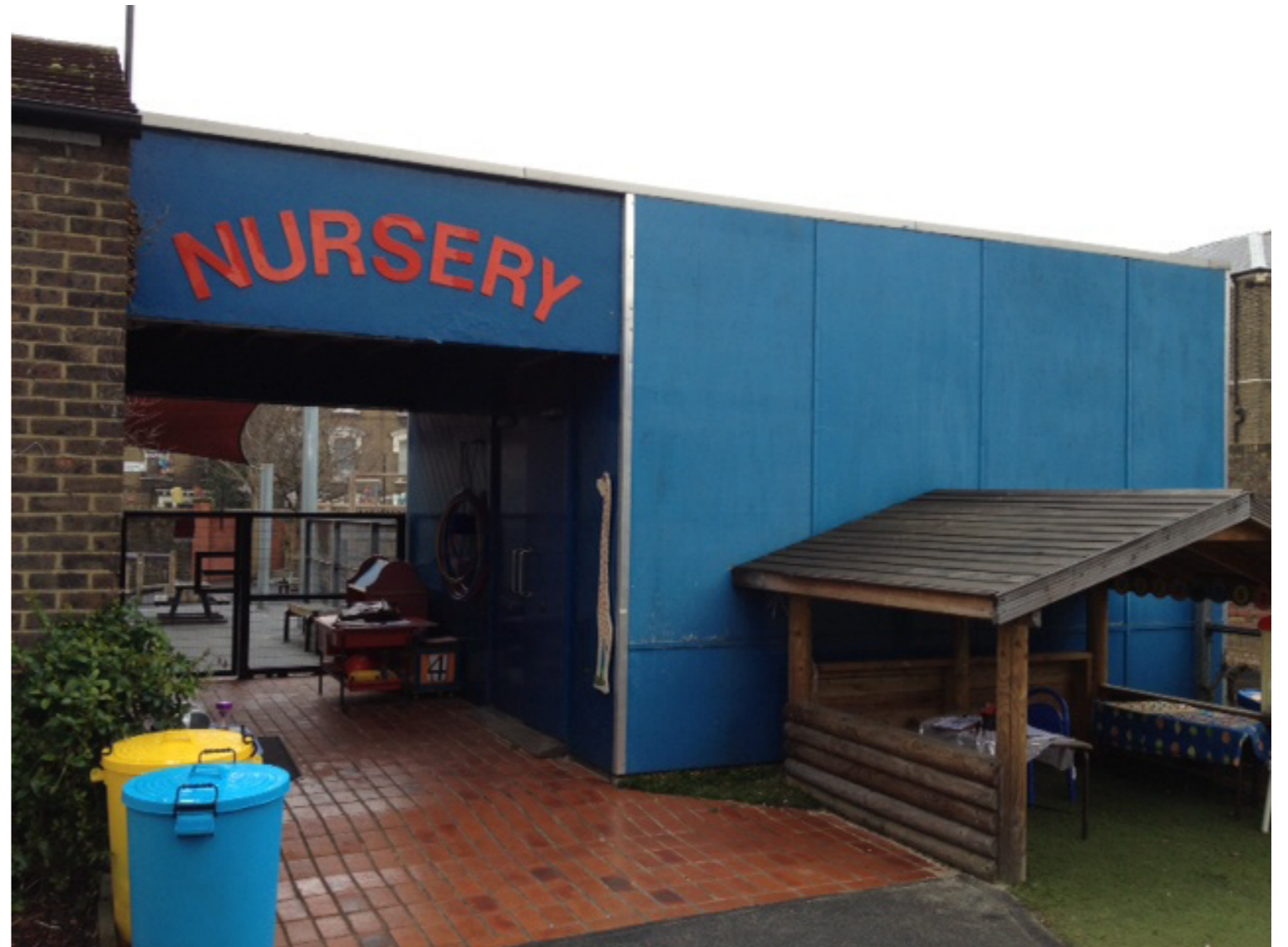
EXISTING NURSERY STORE BUILDING