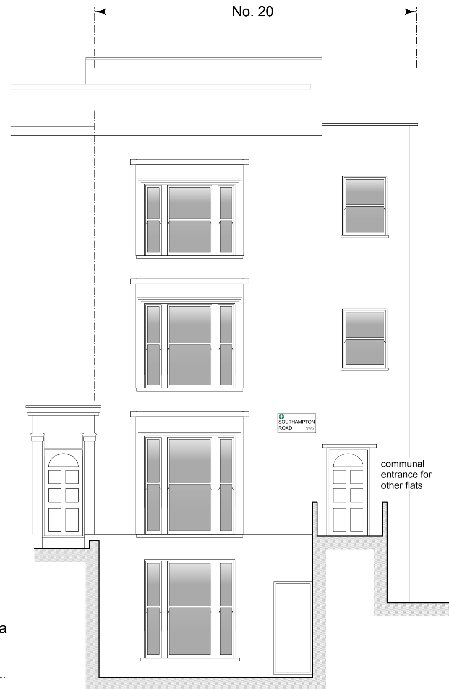
EXISTING FRONT ELEVATION FROM WITHIN PROPERTY