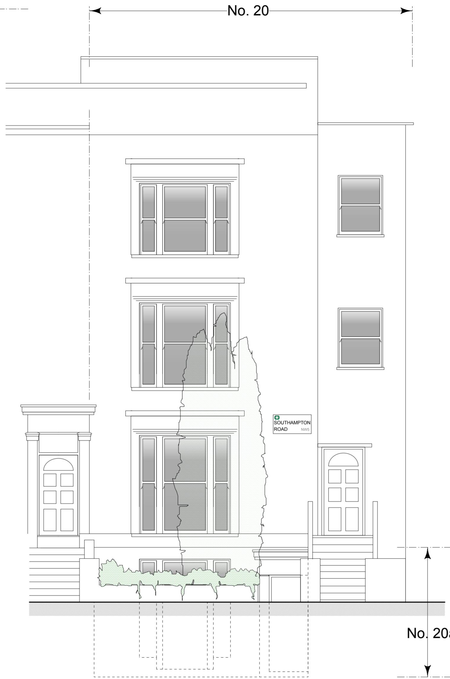
PROPOSED FRONT ELEVATION FROM STREET LEVEL