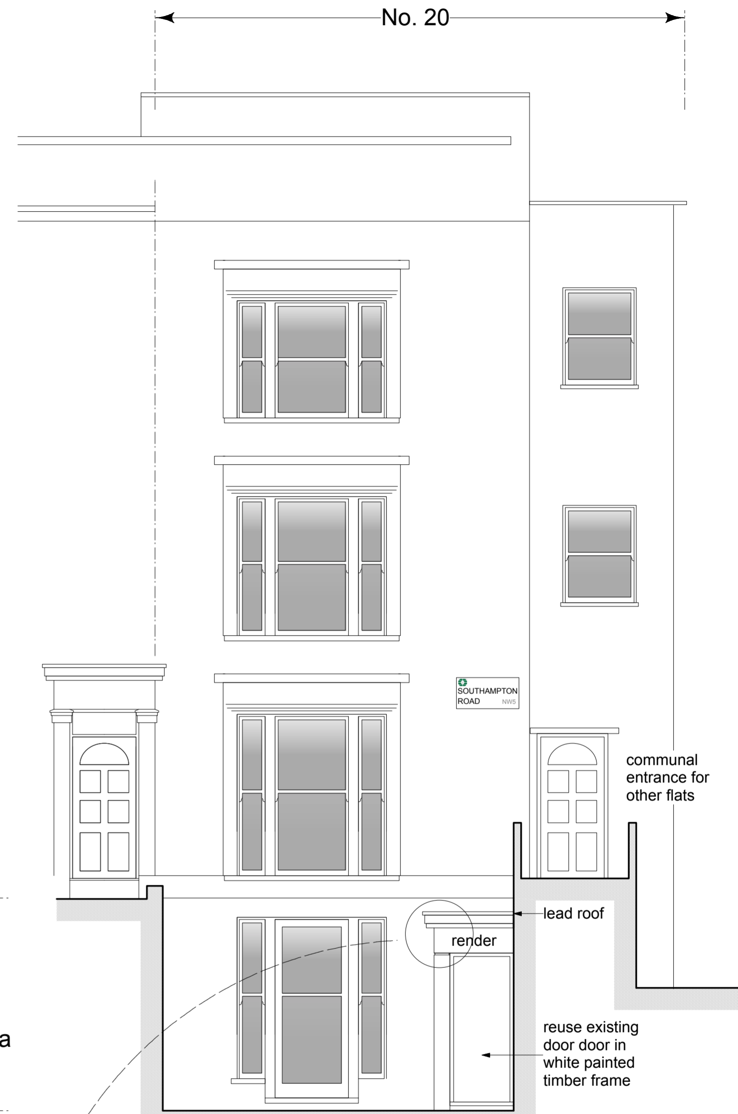
PROPOSED FRONT ELEVATION FROM WITHIN PROPERTY