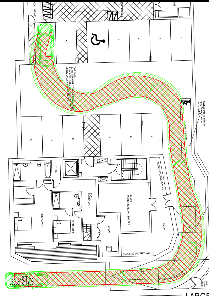
LARGE CAR - ENTRY