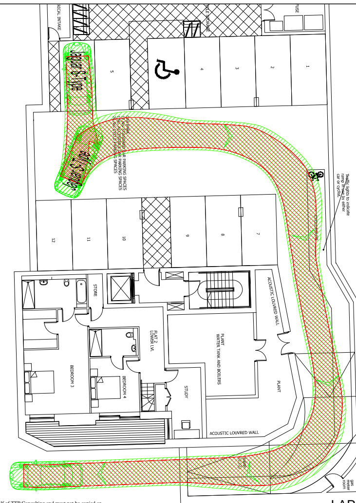
LARGE CAR - EXIT