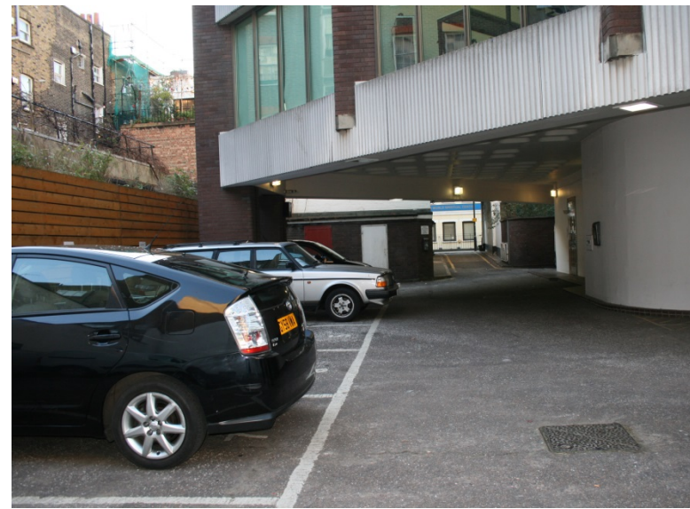
VIEW OF PARKING AND MEWS