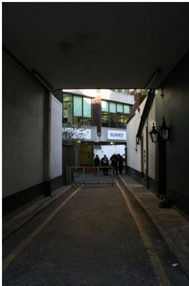
VIEW LOOKING INTO THE SITE