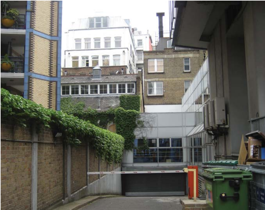
Photo showing the rear of Craven House as viewed from Newton Street. The proposals will not be visible from either Newton Street or Kingsway.