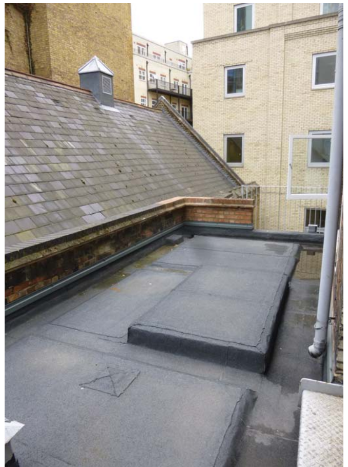
Photos showing the existing flat roof to the rear of the 1st floor.