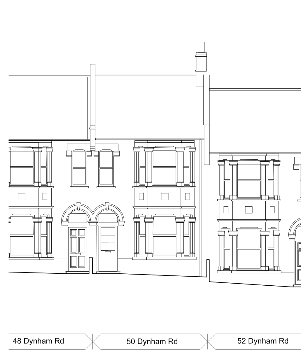
Front Elevations As Existing (unchanged)