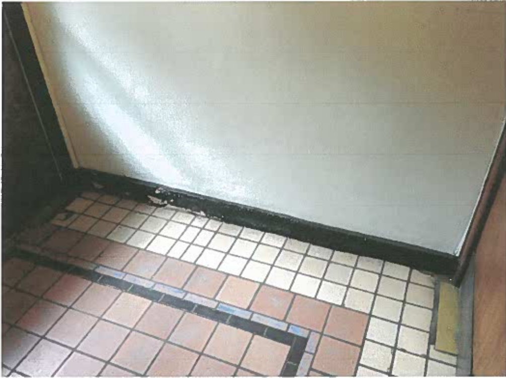
Low level section of wall where chair storage door opening is to be created (corridor side)