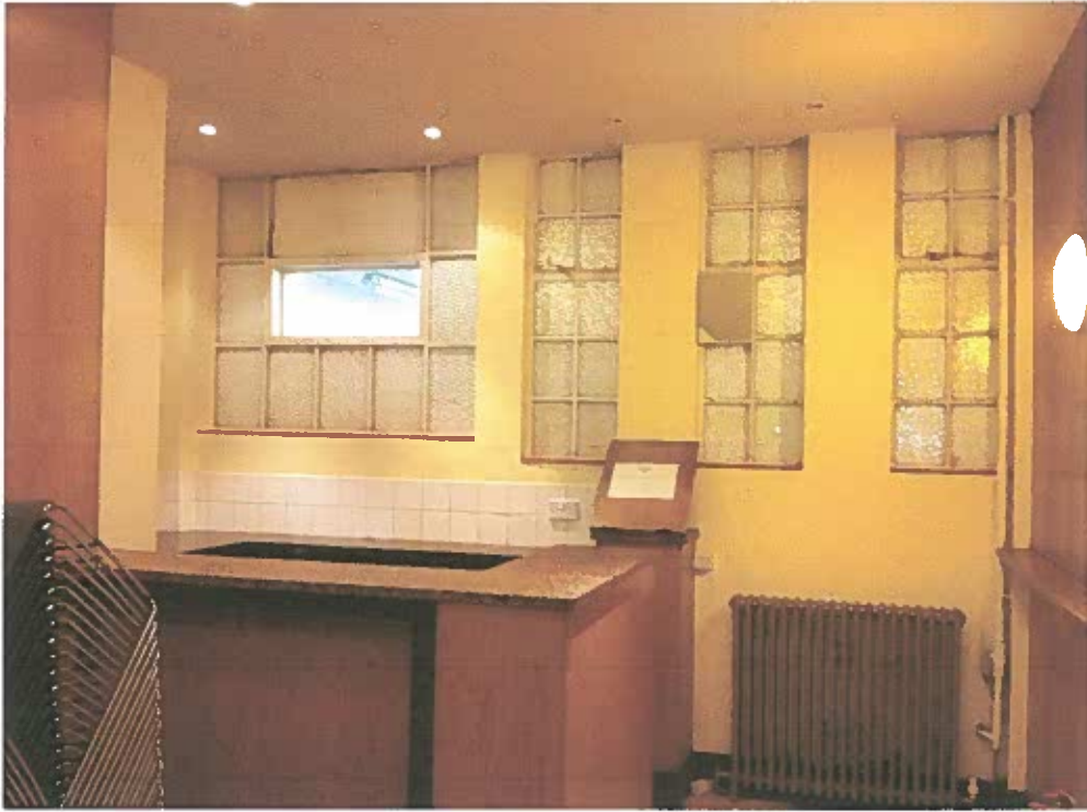
Servery. New door opening into kitchen to be constructed in opening on left-hand side of this picture.