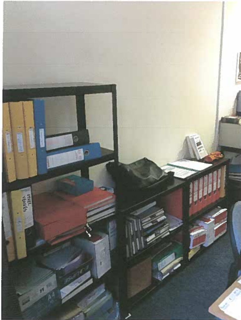
Low level section of wall where chair storage door opening is to be created (lettings office side)