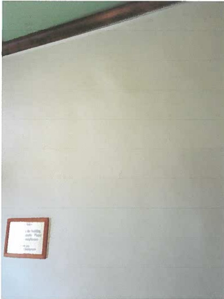
High level section of wall where chair storage door opening is to be created (corridor side)