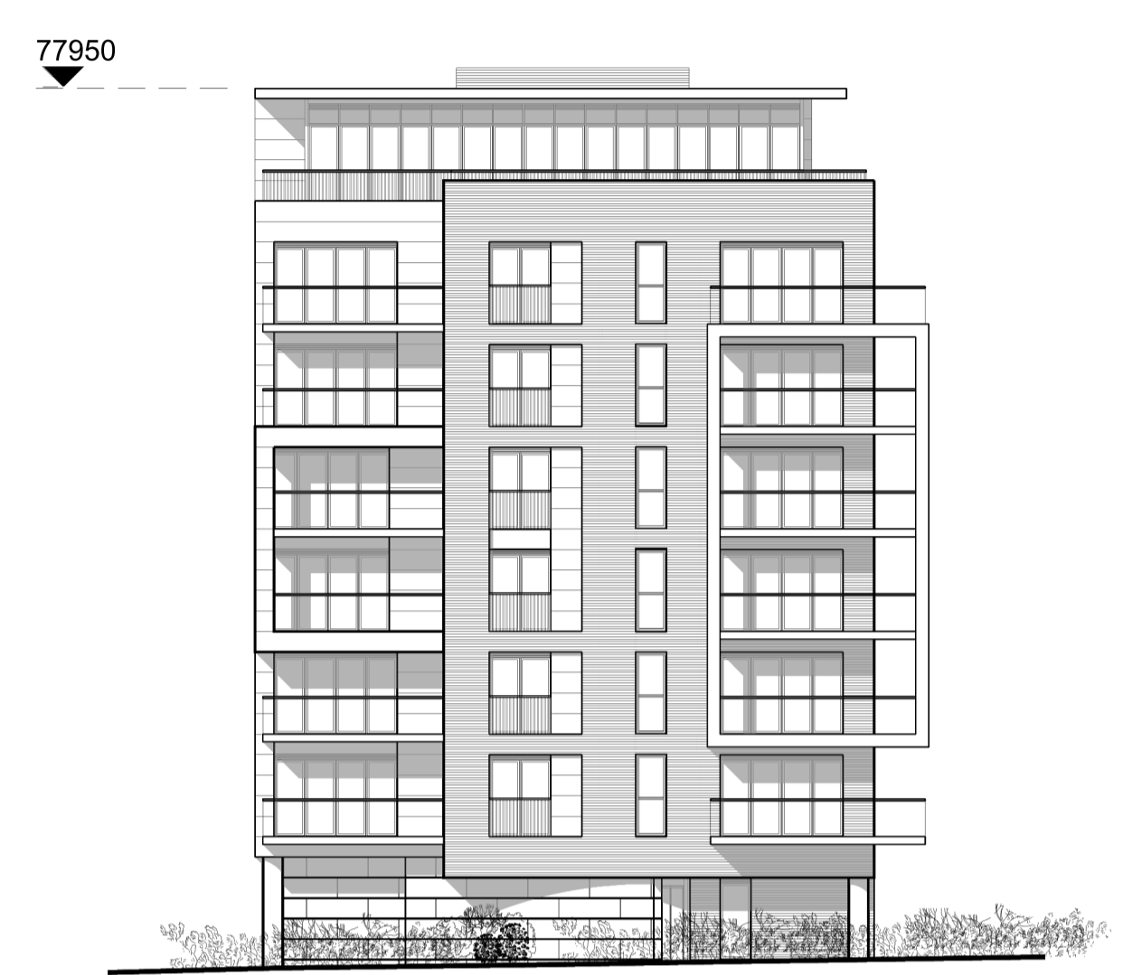
SOUTH ELEVATION SCALE: 1-200