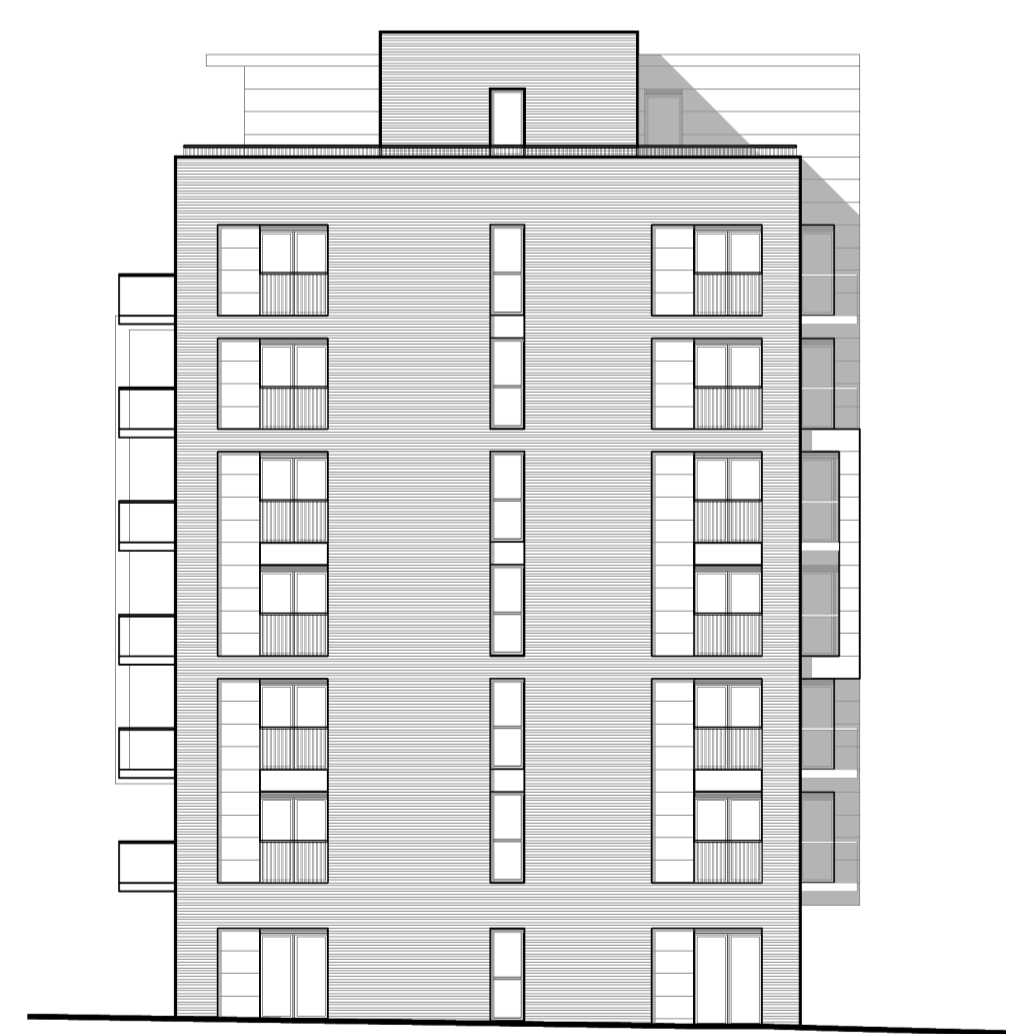
NORTH ELEVATION SCALE: 1-200