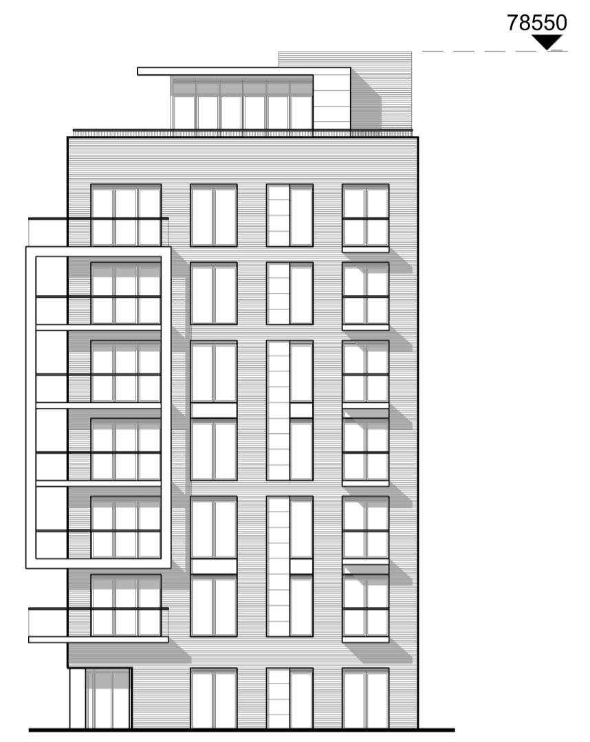
EAST ELEVATION SCALE: 1-200