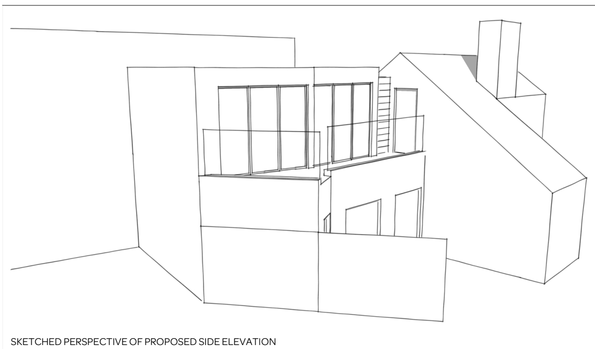
SKETCHED PERSPECTIVE OF PROPOSED SIDE ELEVATION