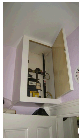
gas meter to be moved from high level position in kitchen to new cupboard in living room