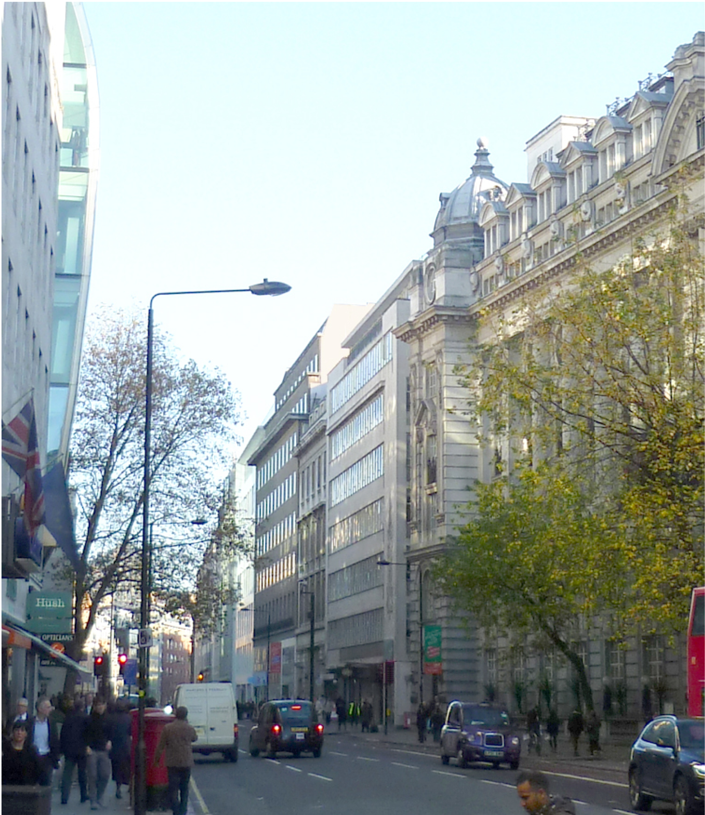
EXISTING VIEW LOOKING EAST