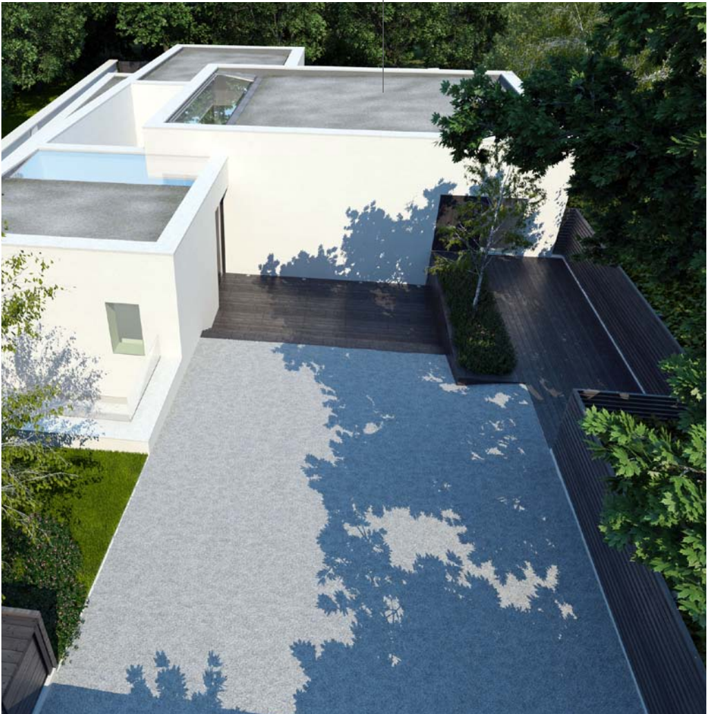
Proposed External Finish - front approach (bird's eye view)