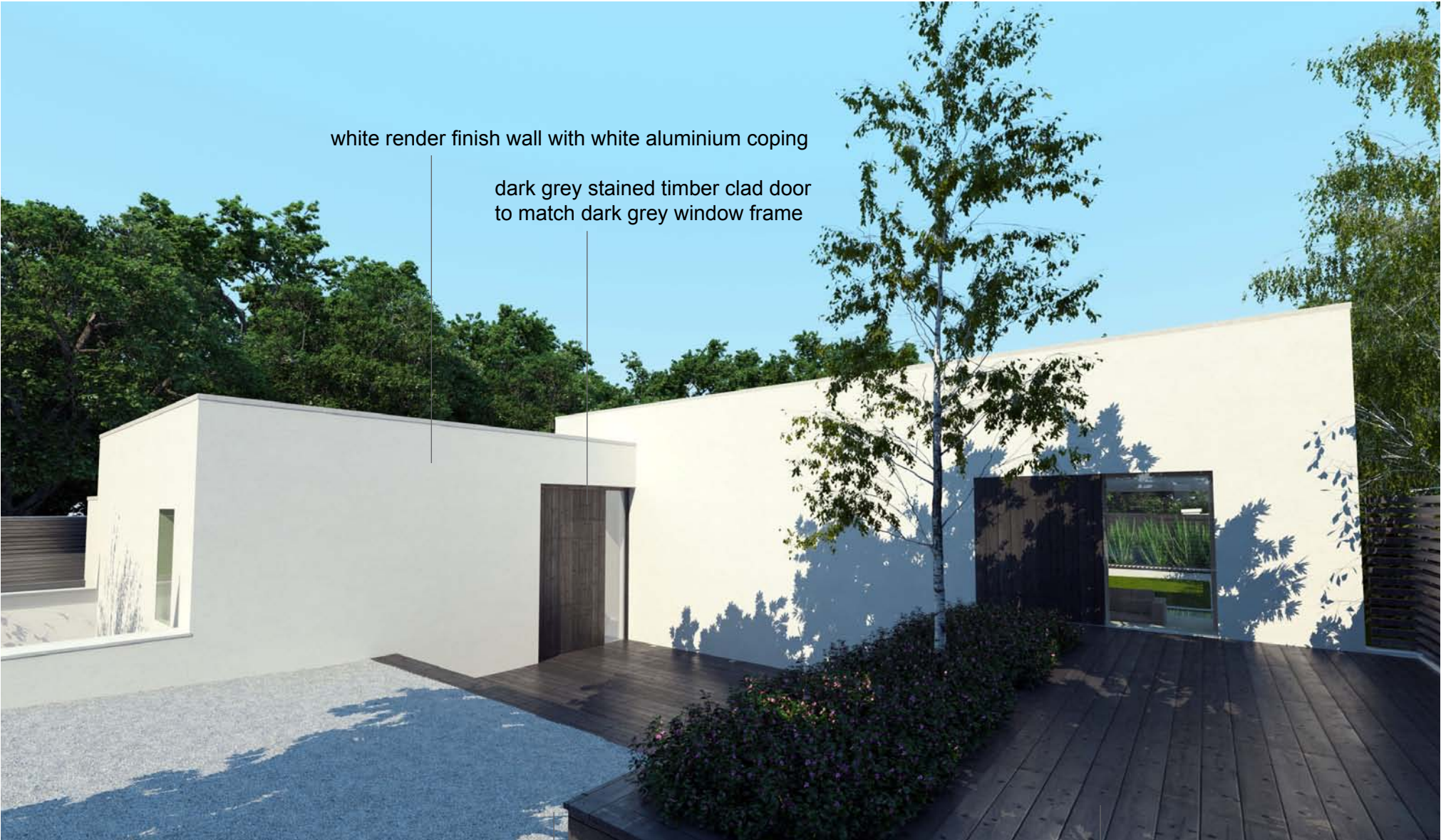
Proposed External Finish - front approach to entrance

Proposed External Finish Materials Application Ref: 2009/5102/P, condition 3