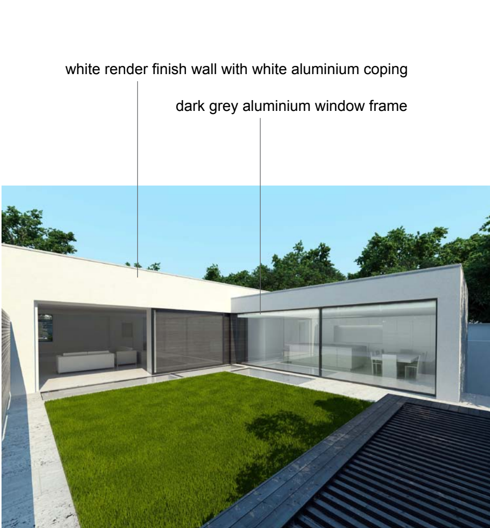
Proposed External Finish - ground floor courtyard

gravel ballast on dark grey single ply membrane