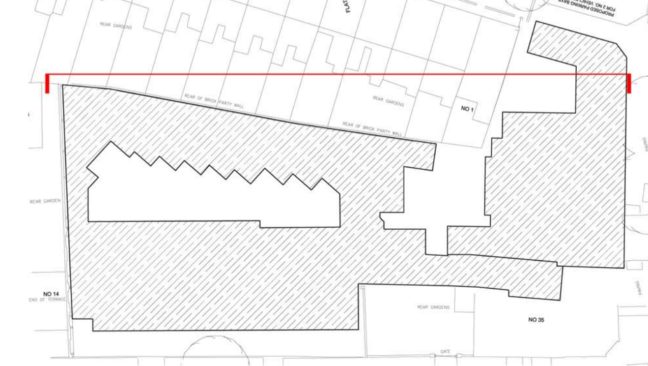
KEY PLAN scale 1:500@A1