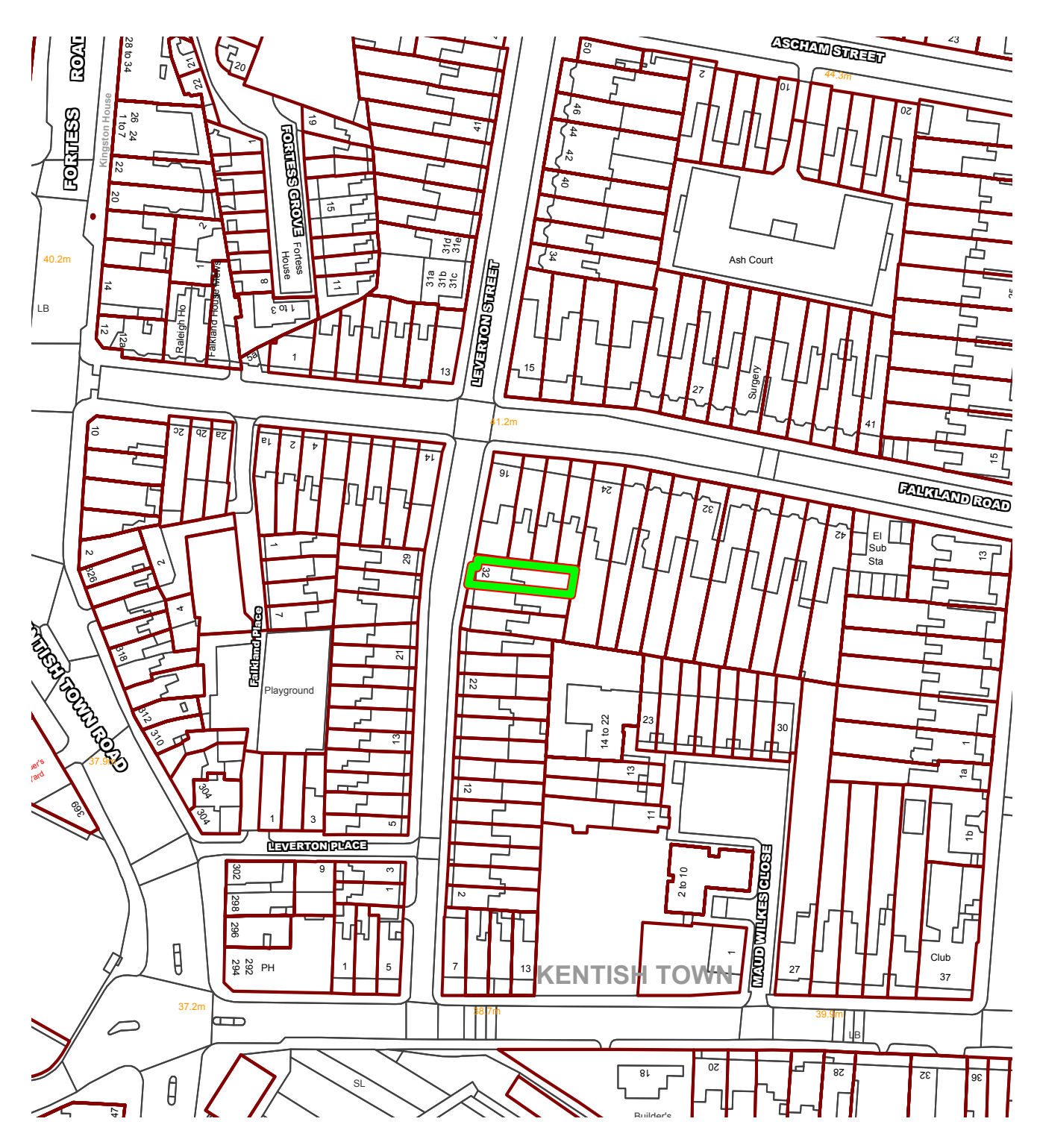
32 Leverton Street