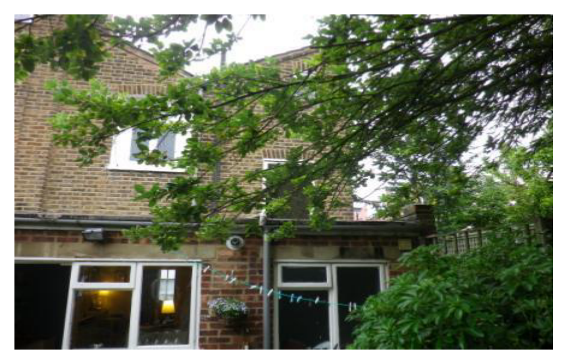
Rear of 32 Leverton Street