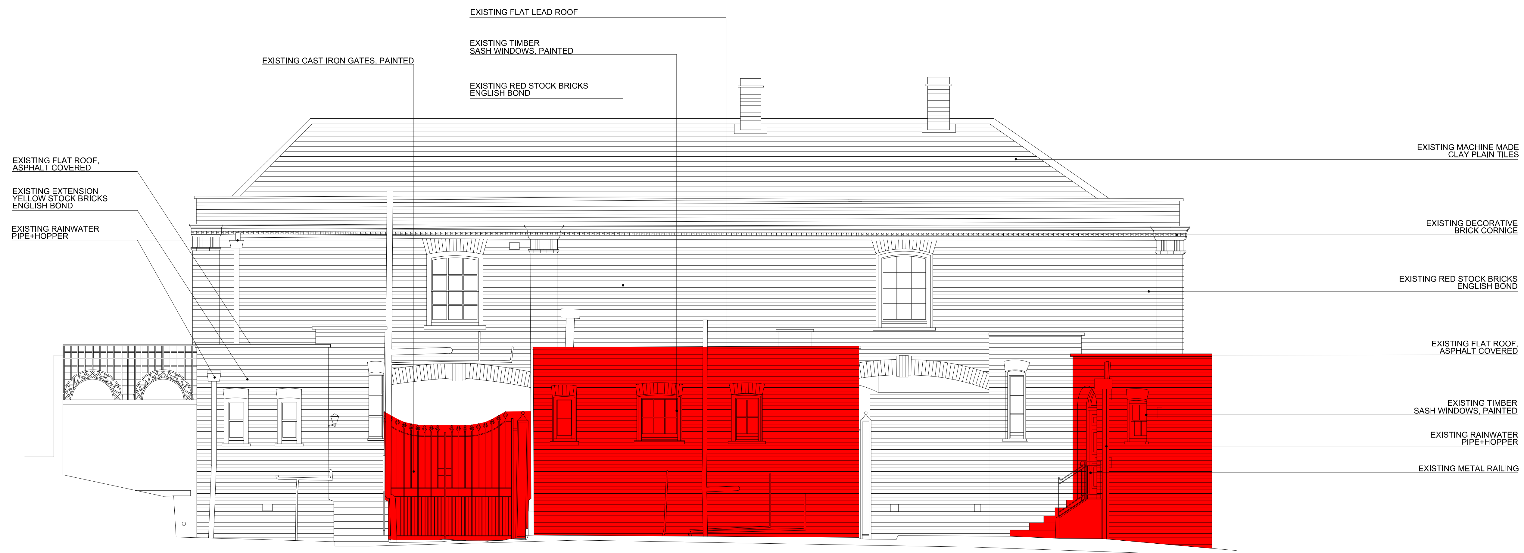
11 REAR ELEVATION 1:50 @ A0