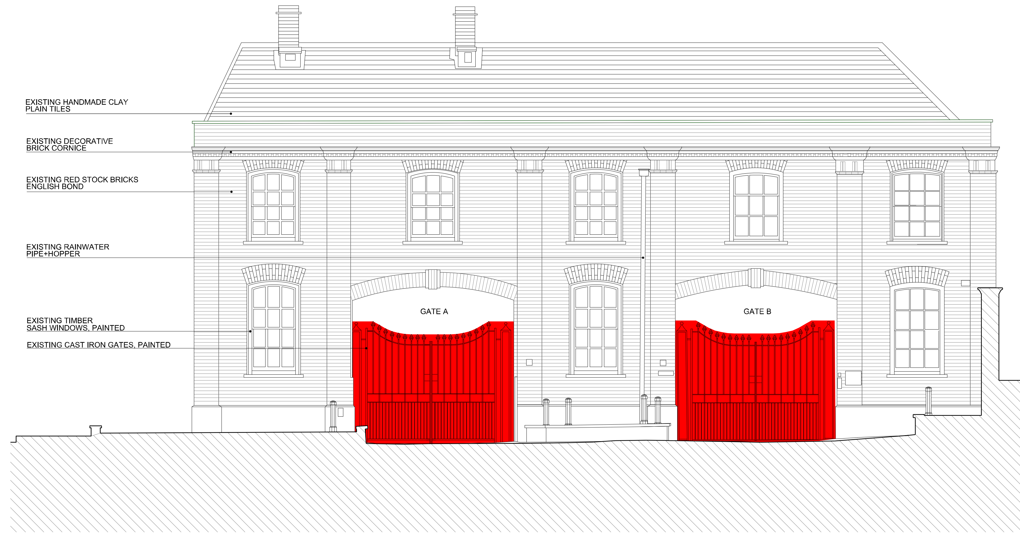
10 FRONT ELEVATION 1:50 @ A0