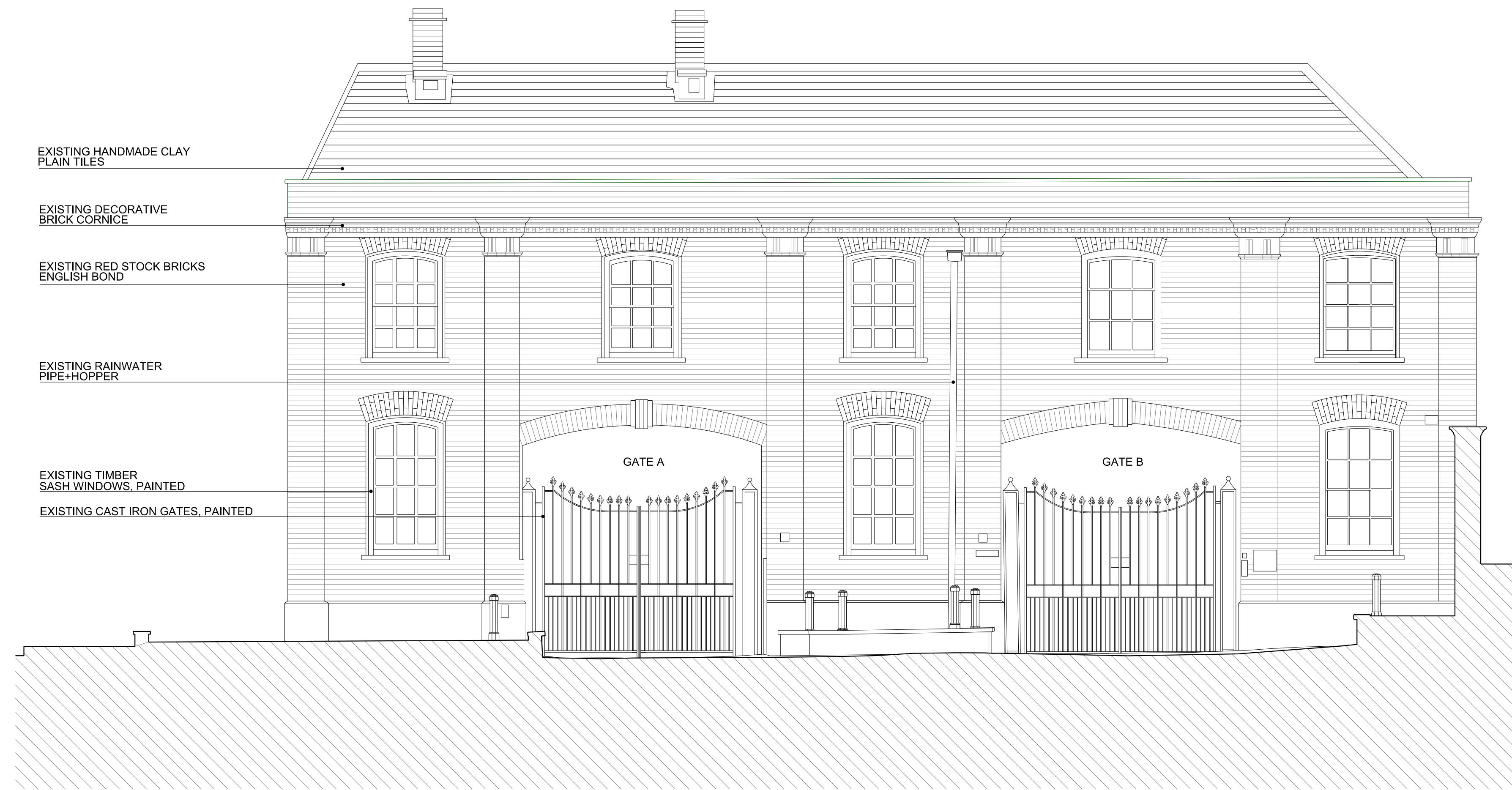
10 FRONT ELEVATION 1:50 @ A0