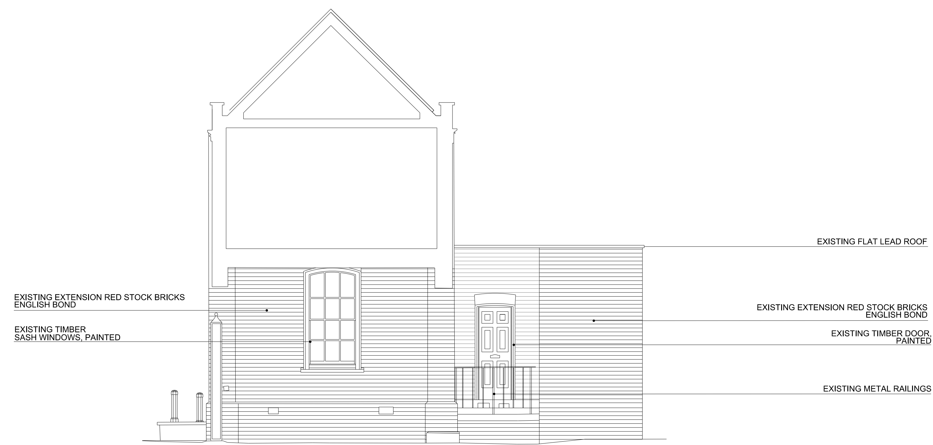
06 SIDE ELEVATION B 1:50 @ A0