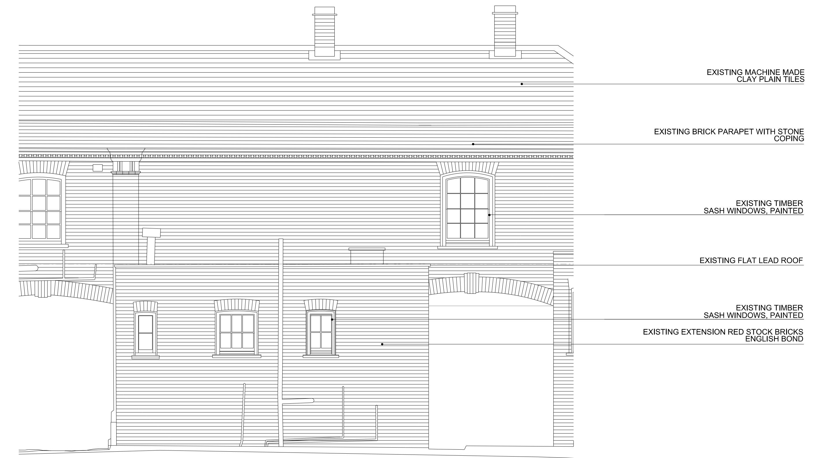
05 REAR ELEVATION B 1:50 @ A0