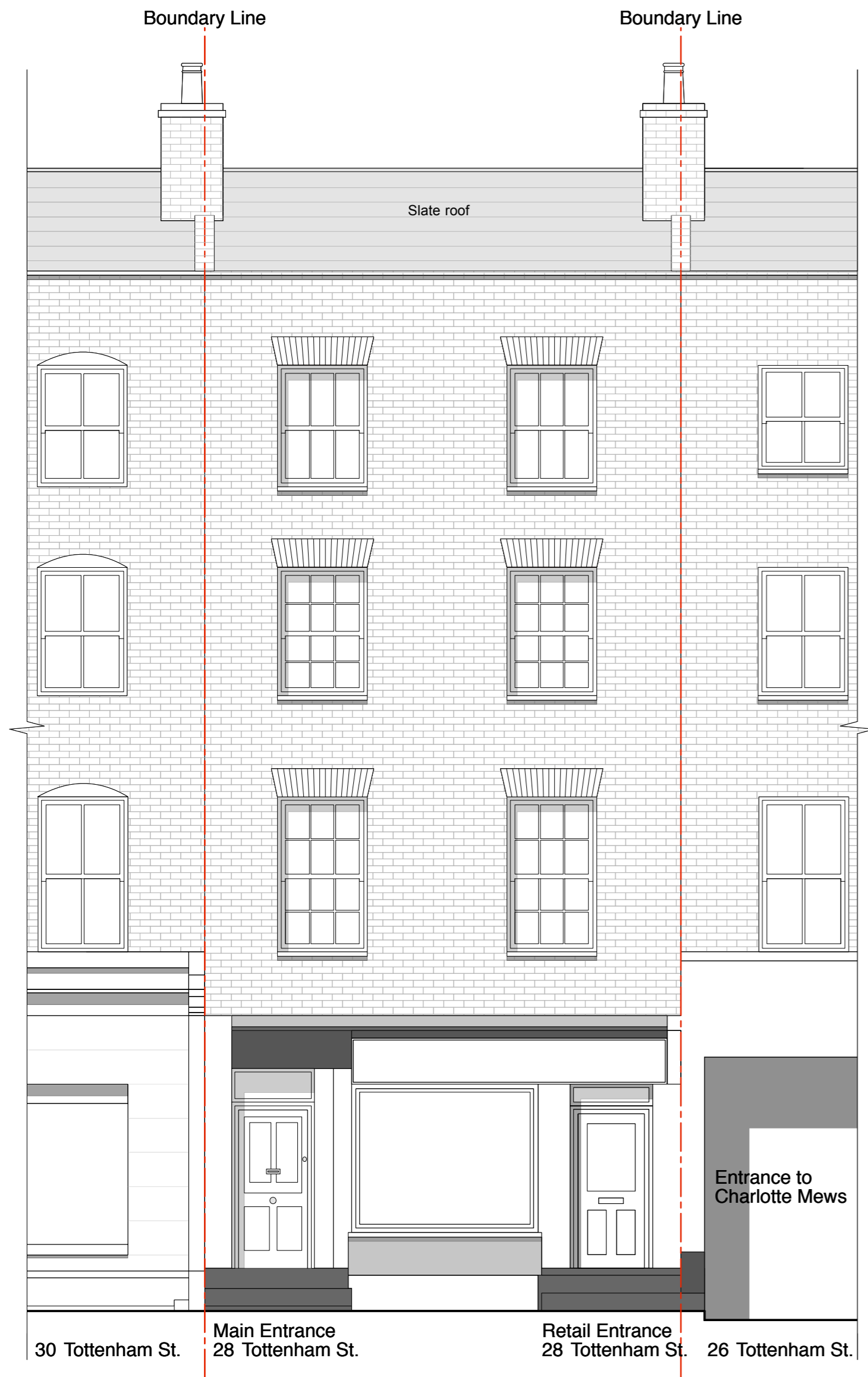
01 Tottenham Street Elevation