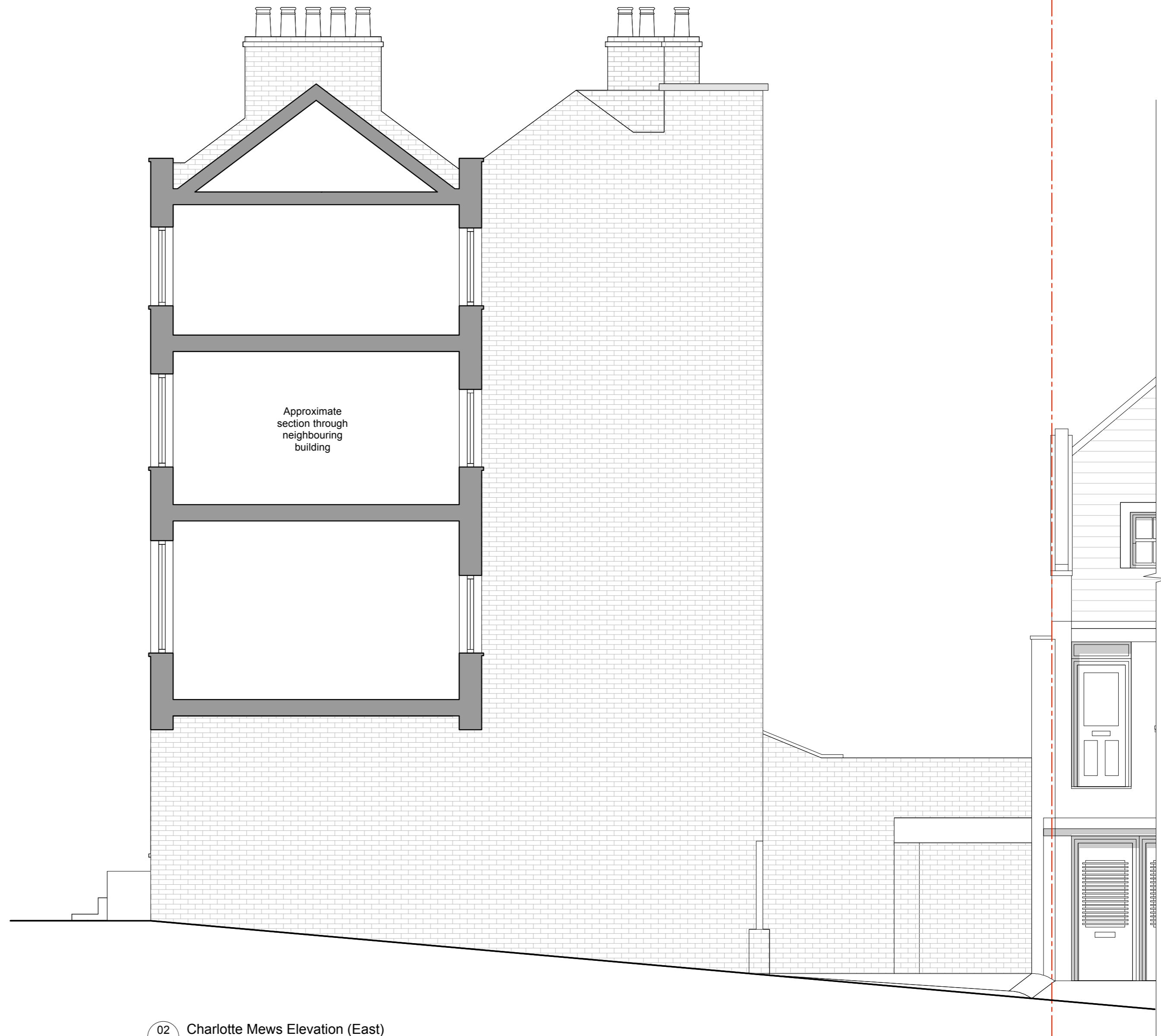
02 Charlotte Mews Elevation (East)