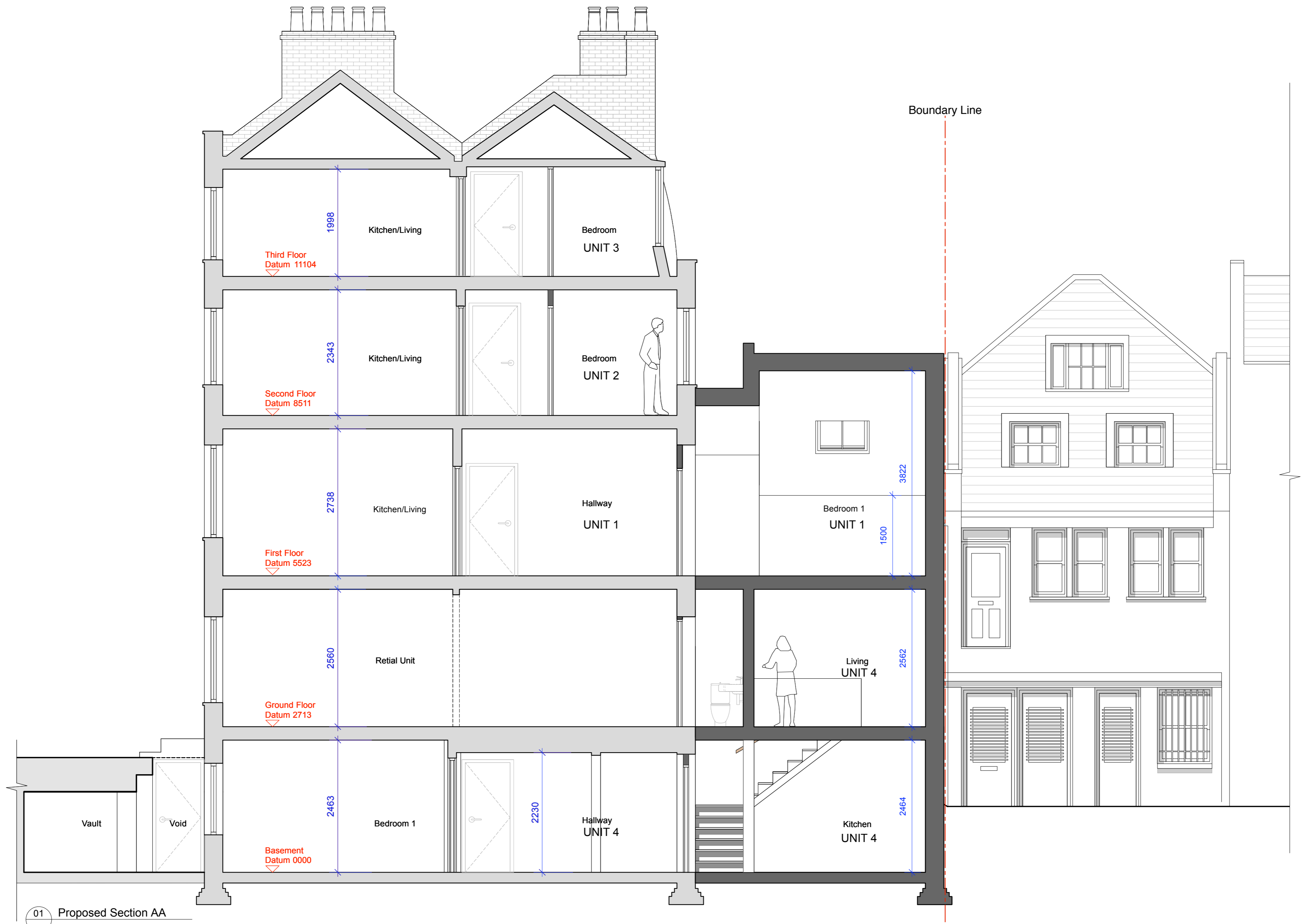
01 Proposed Section AA