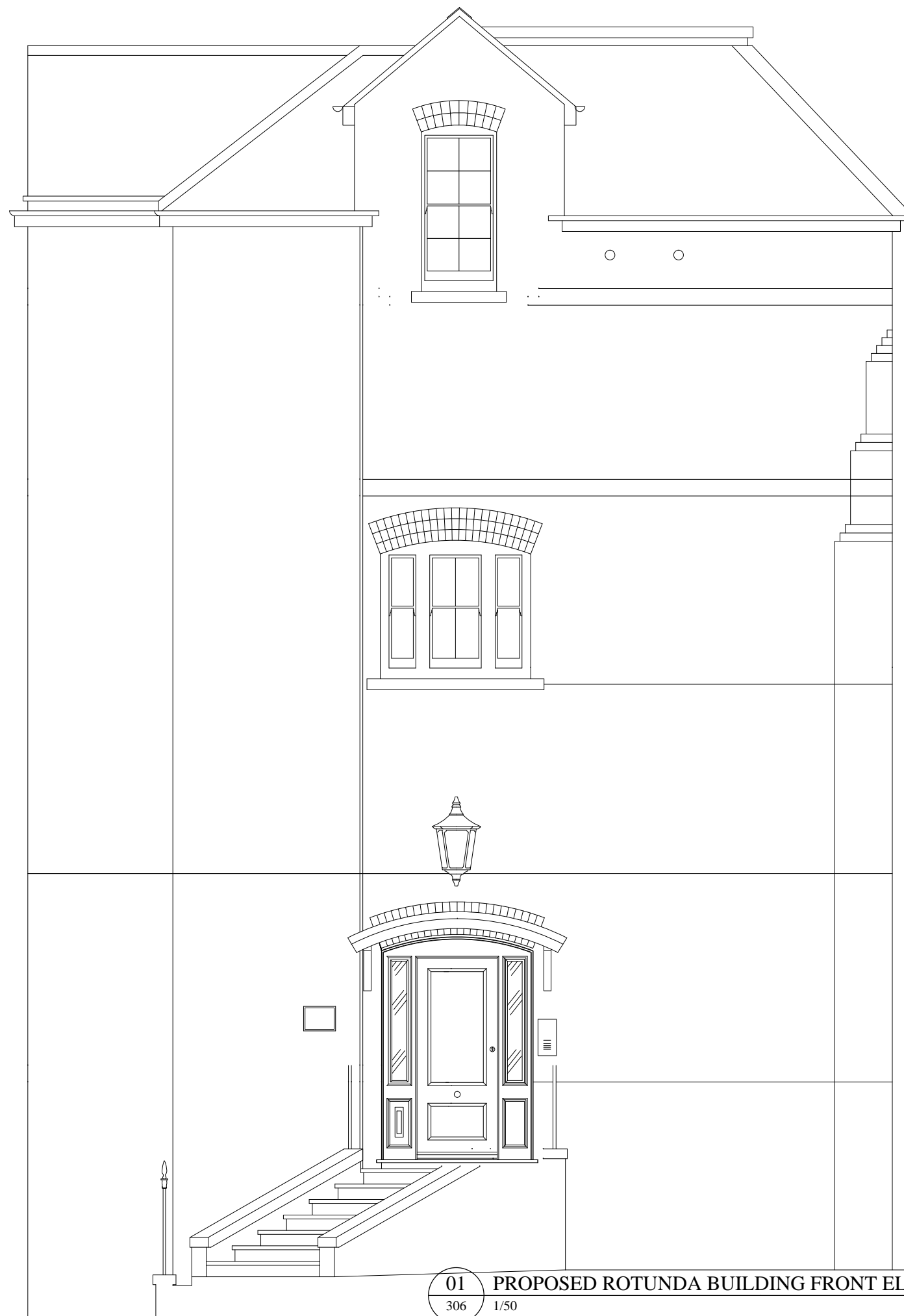
01 PROPOSED ROTUNDA BUILDING FRONT ELEVATION 306 1/50